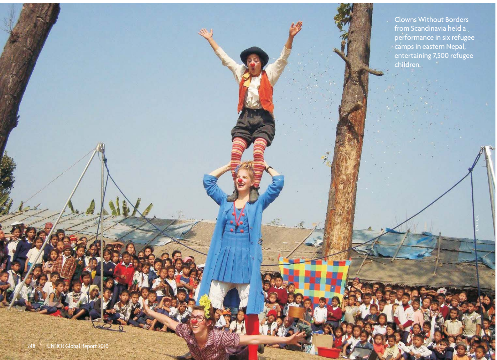
Clowns Without Borders from Scandinavia held a performance in six refugee camps in eastern Nepal, entertaining 7,500 refugee children.