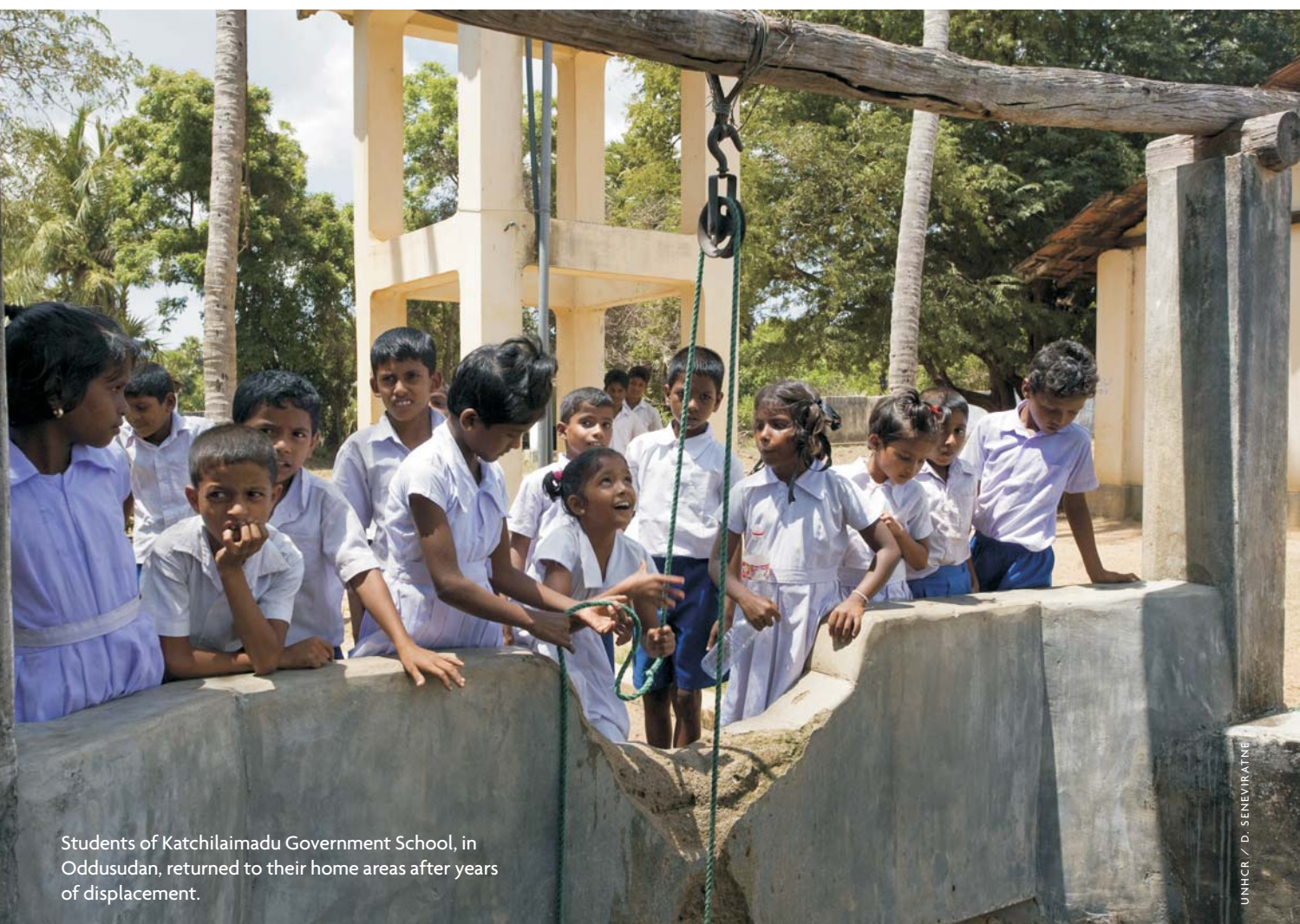
Students of Katchilaimadu Government School, in Oddusudan, returned to their home areas after years of displacement.

20,000 remained in the camps, while 183,000 IDPs who had been displaced before April 2008 remained in displacement throughout the country. Some 2,500 people were left stranded, unable to return to their homes because of concerns related to incomplete mine removal, unexploded ordnance and occupation of their land. In spite of the progress achieved in 2010, many humanitarian needs still remained to be met in the north.