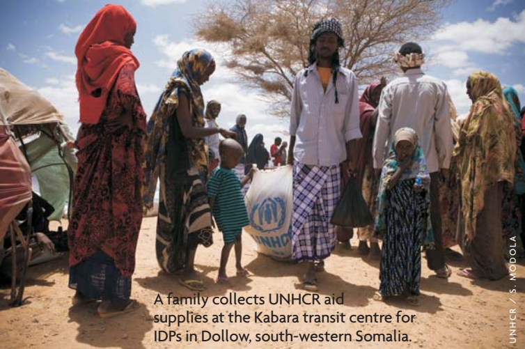
A family collects UNHCR aid supplies at the Kabara transit centre for IDPs in Dollow, south-western Somalia.