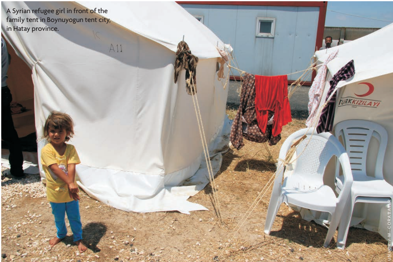
A Syrian refugee girl in front of the family tent in Boynuyogun tent city, in Hatay province.