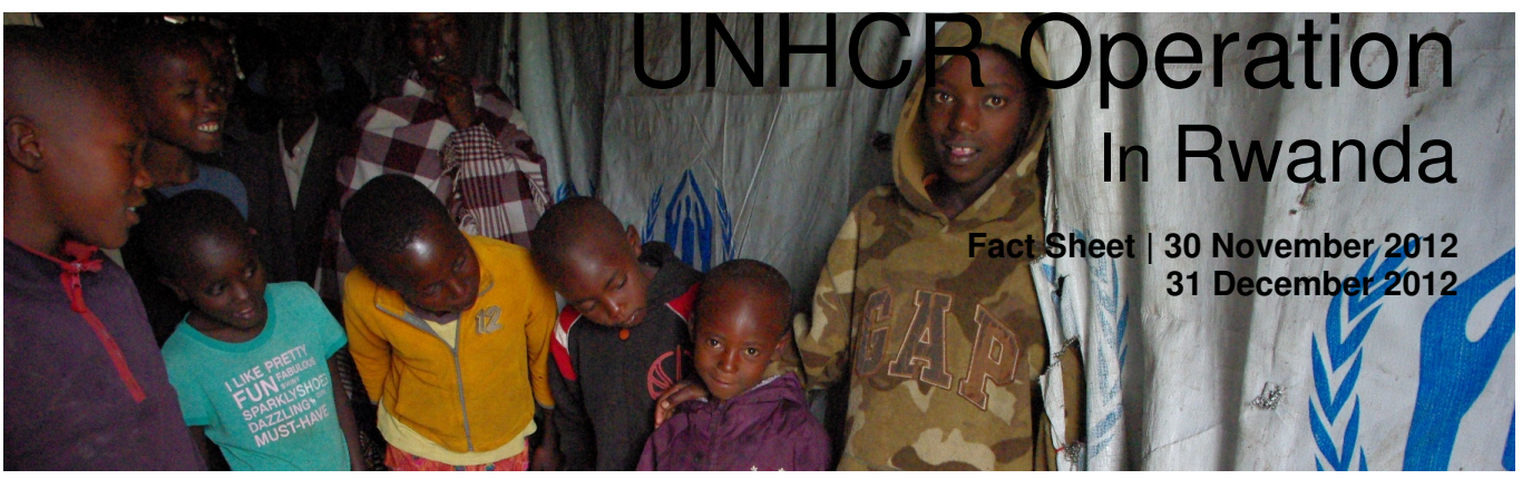
Children at Nkamira Transit Centre awaiting transfer to Kigeme Camp, after fleeing from the November fighting in Eastern DRC