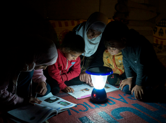
A mother helps her children with their school work in the UNHCR Azraq refugee camp in Jordan, by the light of a solar powered lamp.

"It is a privilege for us to work with UNHCR's highly skilled staff. They are as passionate and motivated as we are about making everyday life in and around refugee camps better for the children who live there. IKEA co-workers are equally proud of our partnership and of being part of a company that deeply cares for the welfare of refugee children."