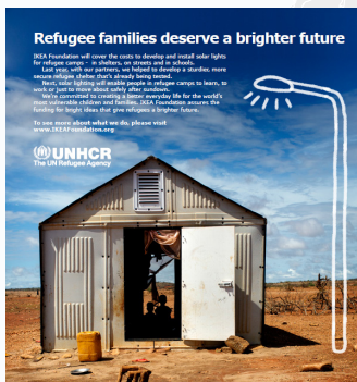
UNHCR page in IKEA 2014-15 catalogue

Each year, for every LEDARE light bulb sold during the campaign period in participating IKEA stores, 1 Euro is donated to UNHCR's operations. Funds raised through the campaign go toward education and renewable energy projects. In 2014, EUR 7.7 million were raised.