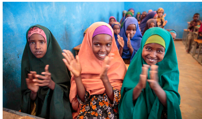
Students at an IKEA Foundation-supported school in Dollo Ado, Ethiopia, UNHCR/Ose/January 2014