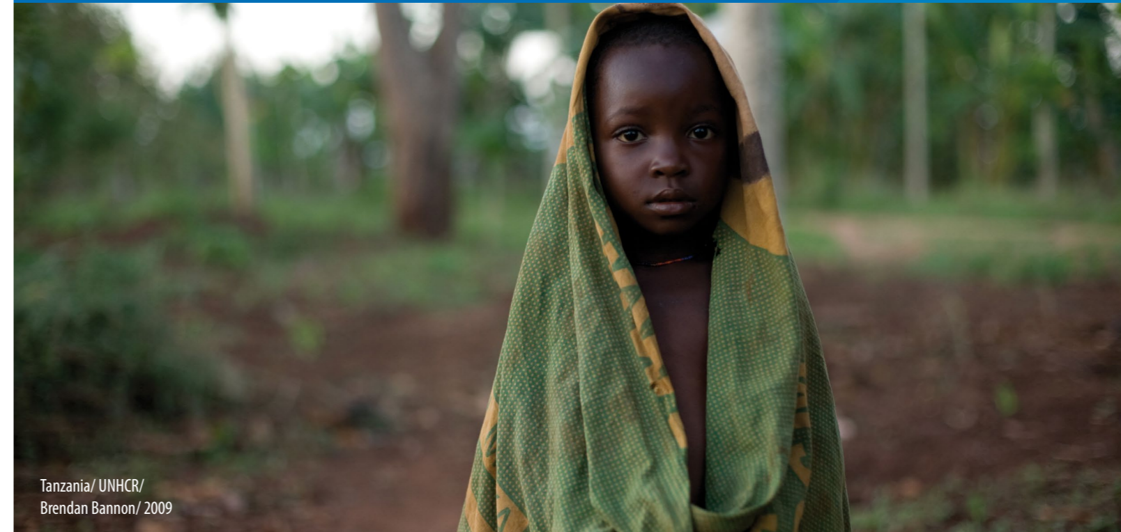
Tanzania/ UNHCR/ Brendan Bannon/ 2009

Through the Alternatives to Camps Series, UNHCR provides key guidance, useful approaches, tools and good practices to support the implementation of the key actions outlined in the Policy on Alternatives to Camps . The Series also includes a call for sharing your good practices.