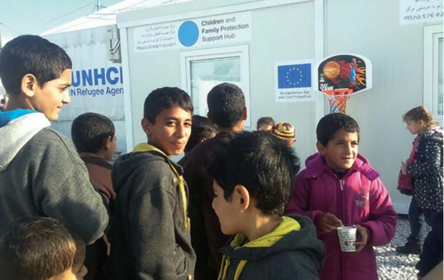
Children receive assistance at the Blue Dot child and family protection support hub in Gevgelija in the former Yugoslav Republic of Macedonia.