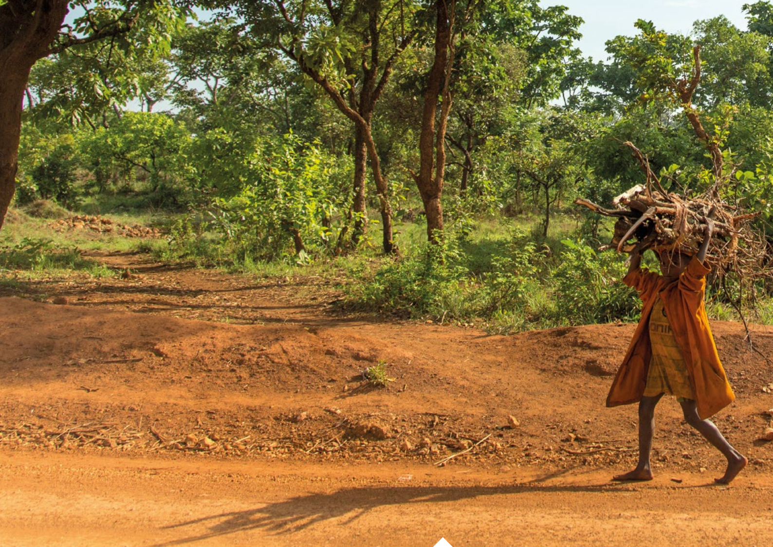
A Burundian refugee boy collects firewood outside Nyarugusu camp in the United Republic of Tanzania. The task takes hours and takes him out of school.