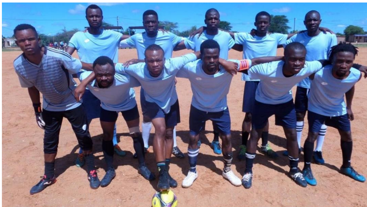
One of the teams in the sports events organized by The Society for Family Health in Osire settlement, Namibia.