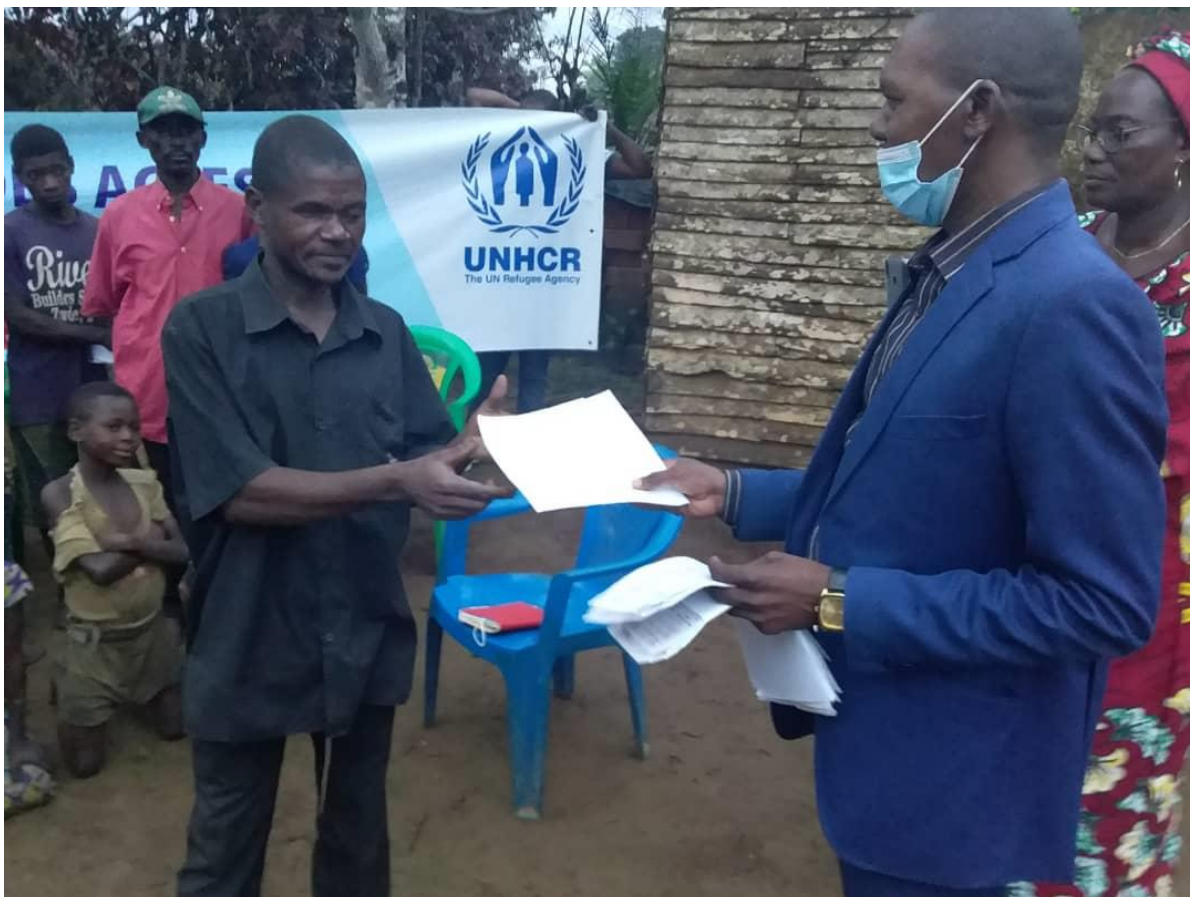
Ceremony for the delivery of birth certificates to indigenous populations in the Lekoumou Department