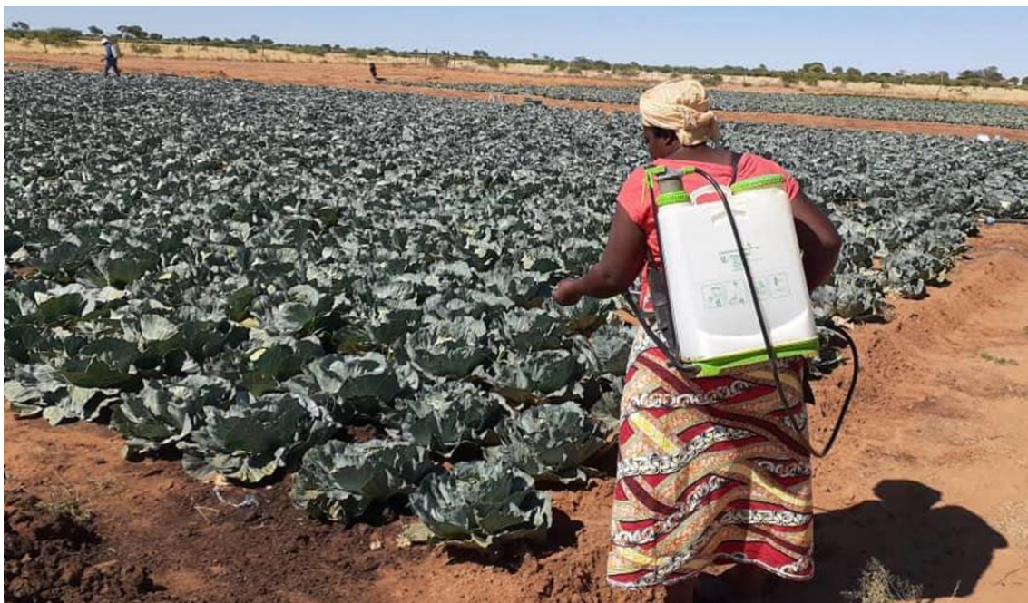
Horticulture production in Osire settlement, Namibia.