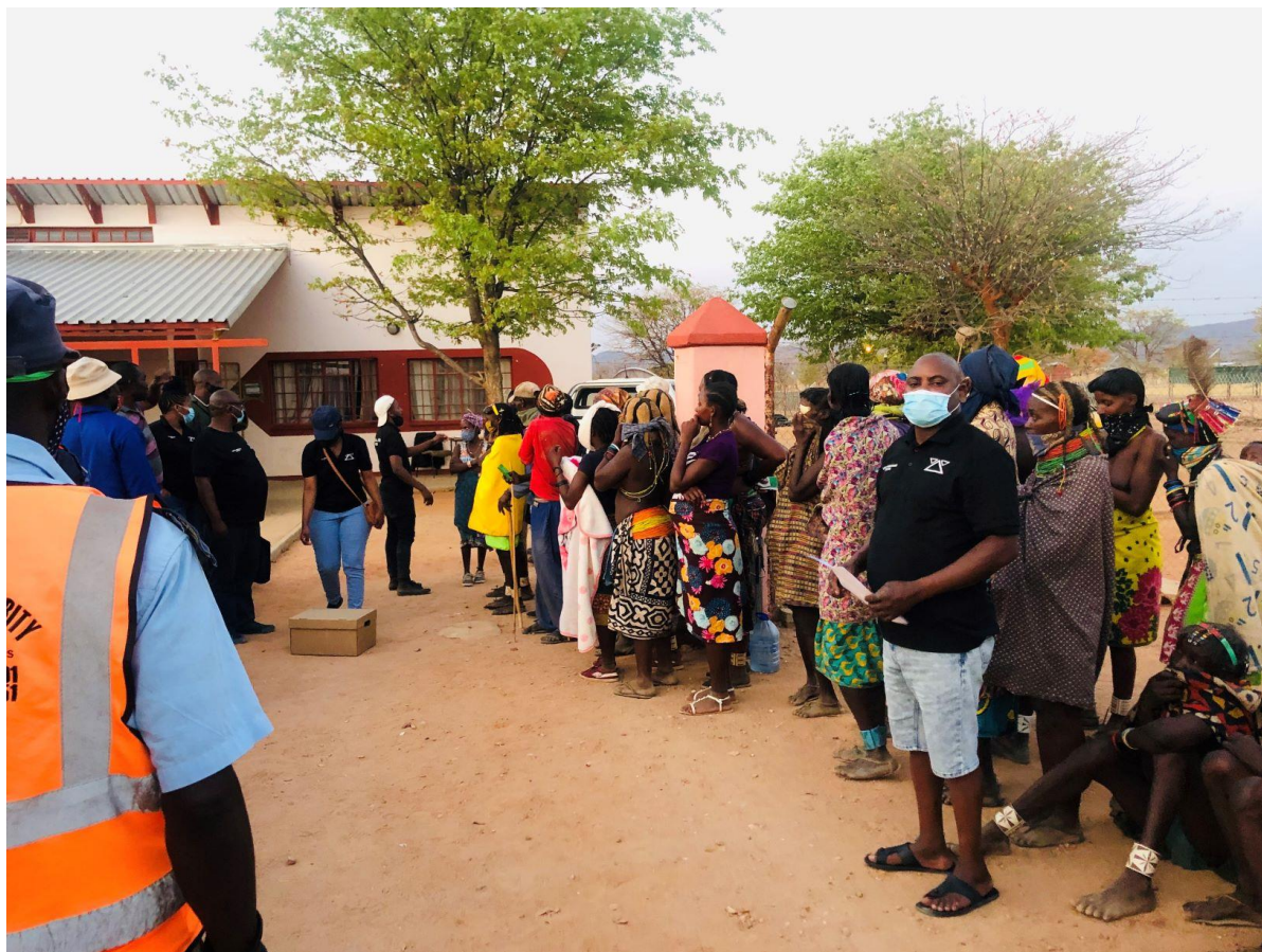
Data collection in Namibia