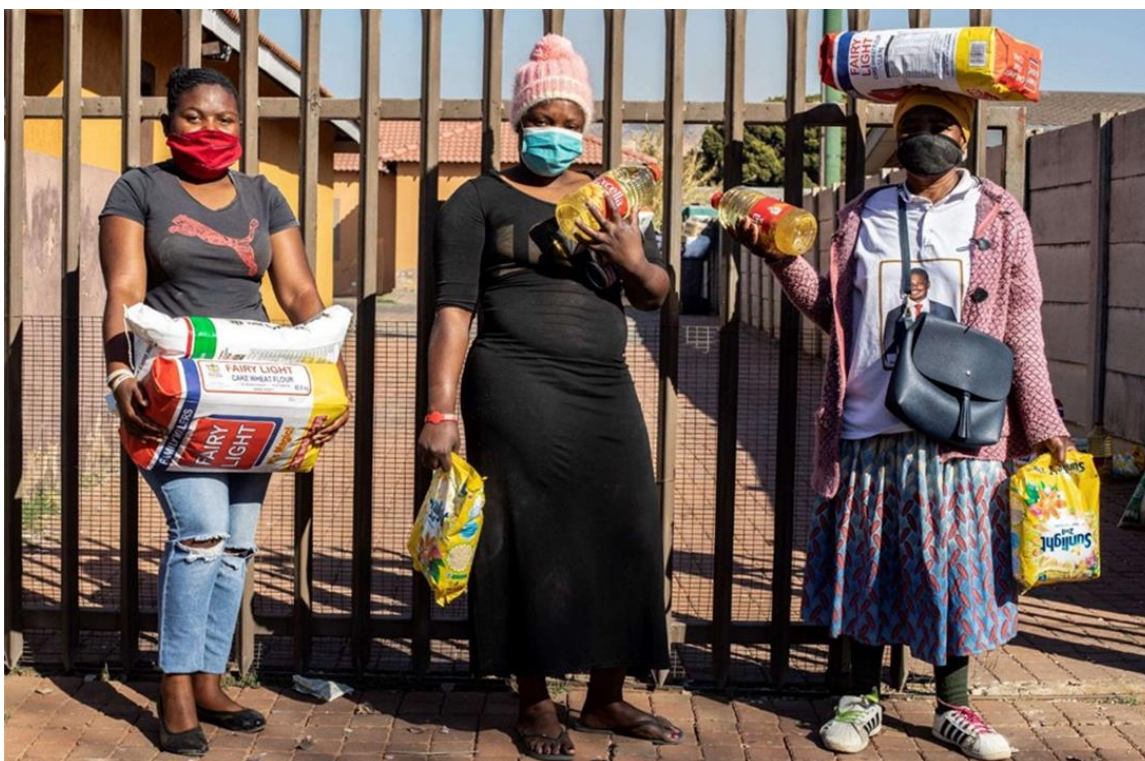
Local women assisted by the Somali business community in Pretoria, South Africa. Refugees helped host communities during COVID-19 by distributing aid to local families in need.