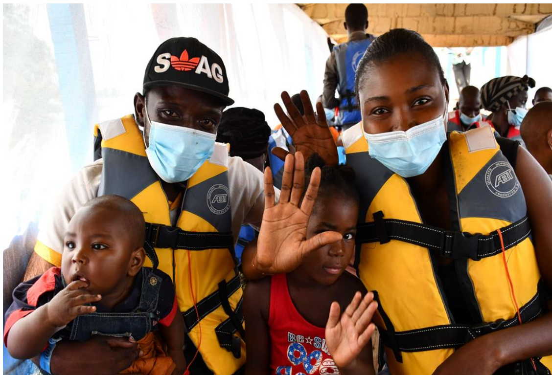
A family crosses the Ubangi river as voluntary repatriation from the Democratic Republic of the Congo to the Central African Republic resumes following COVID-19 delays.