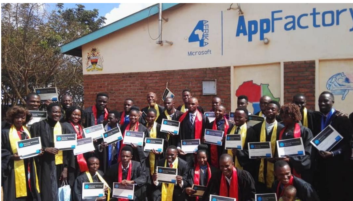
Graduates of the AppFactory coding school in Dzaleka refugee camp, Malawi.