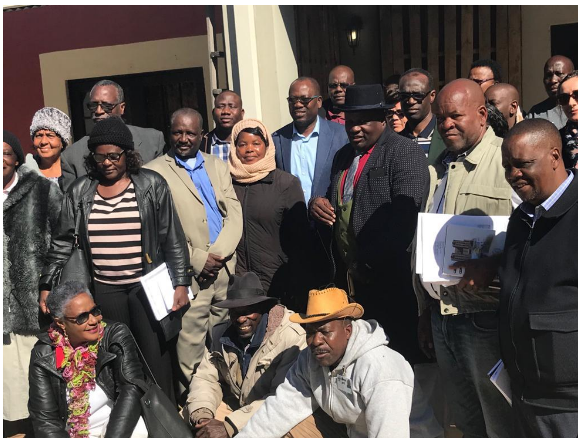
National Consultations on the statelessness conventions in Namibia.