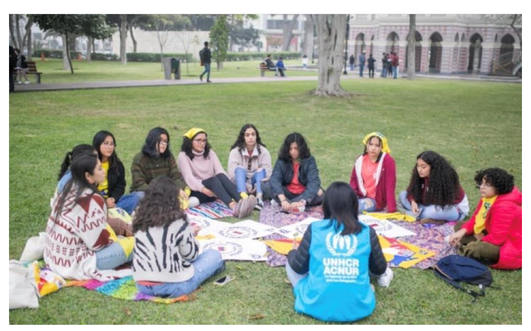
Young Venezuelan and Peruvian girls take part in a workshop run by Quinta Ola.