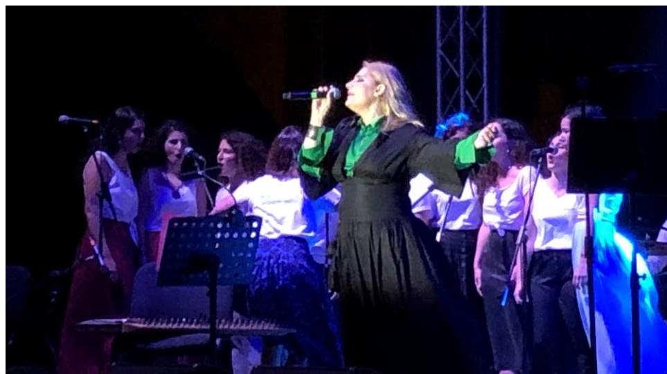
Internationally acclaimed Cypriot artist Alexia, performed together with refugee and local children and artists in Nicosia to mark World Refugee Day 2019.