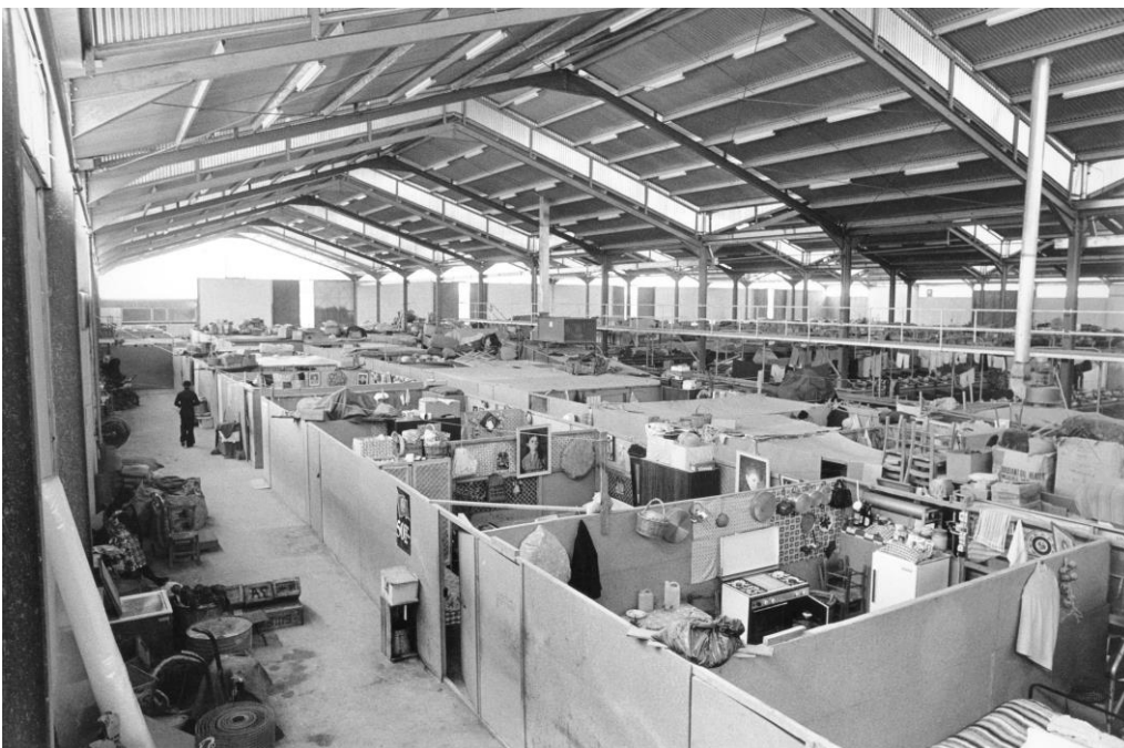
In 1974, some 400,000 people were internally displaced in Cyprus. UNHCR arrived on the island and coordinated humanitarian aid, including food, health and shelter provision.

UNHCR has been present in Cyprus since 1974 when it arrived on the island to provide humanitarian aid for the displaced populations in both communities. By 1998, the need for relief assistance for internally displaced Cypriots had declined, and UNHCR handed over the work to other UN development agencies. With the increase of refugee arrivals in 1998, and in the absence of national asylum legislation and infrastructure, UNHCR had to assume the responsibilities for registering asylum-seekers arriving on the island and processing their applications. In 200, the Republic of Cyprus adopted its first national refugee legislation and asylum procedures, and in 2002 it took over from UNHCR the responsibility for asylum adjudication.