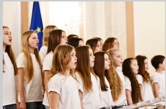
© Šárka Svobodová/ UNIC / March 2024

UNHCR submitted its comments on the proposed amendments to Lex Ukraine, the set of laws providing the legislative framework for the assistance to people displaced from Ukraine in Czechia. The draft Act (Lex Ukraine VII) foresees the possibility to obtain a five-year special residence permit under specific eligibility criteria. UNHCR comments focus on the conditions and protection safeguards for individuals who transition from temporary protection to a special long-term residence permit, and on eligibility for temporary protection and access to effective remedy.