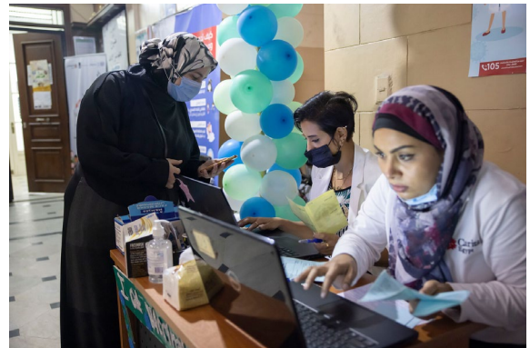
Syrian refugees register through UNHCR's partner Caritas to get vaccinated against Covid-19 in Alexandria, Egypt.