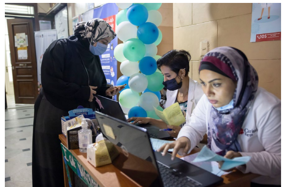
Syrian refugees register through UNHCR's partner Caritas to get vaccinated against Covid-19 in Alexandria, Egypt.