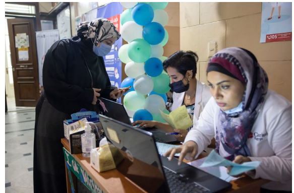
Syrian refugees registers through UNHCR's partner Caritas to get vaccinated against Covid-19 in Alexandria, Egypt.