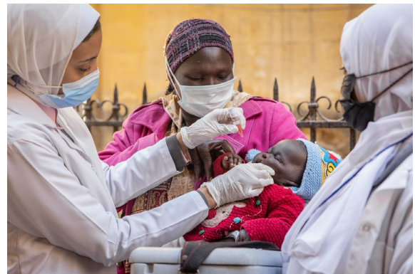
A refugee child receives Polio vaccine as part of the MOHP efforts to vaccinate all children in Egypt.