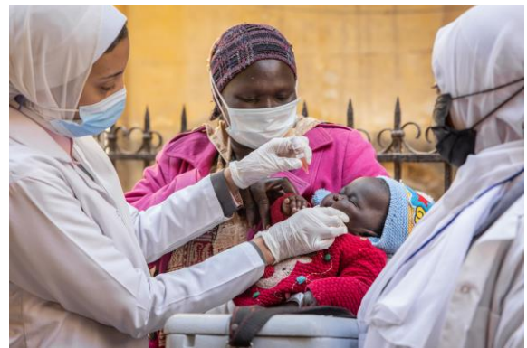
A refugee child receives Polio vaccine as part of the MOHP efforts to vaccinate all children in Egypt.