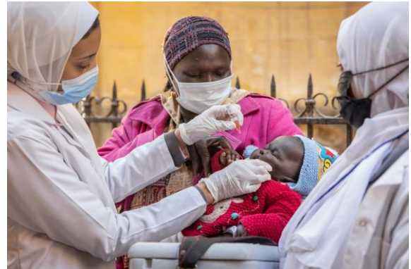
A refugee child receives Polio vaccine as part of the MOHP efforts to vaccinate all children in Egypt.