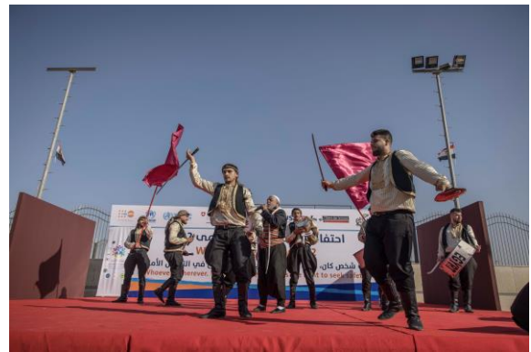
A refugee band performs at a World Refugee Day Event in 6 th of October City, Cairo.