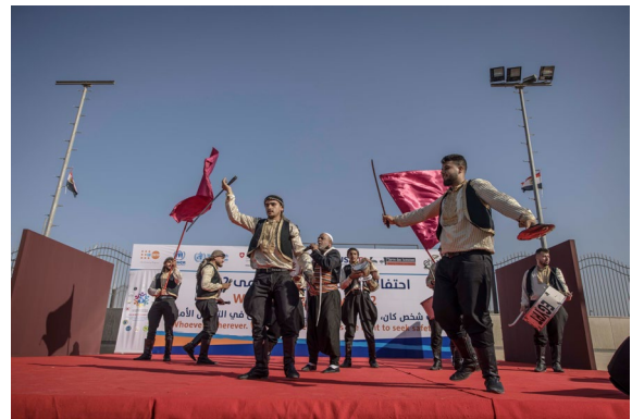
A refugee band performs at a World Refugee Day Event in 6 th of October City, Cairo.