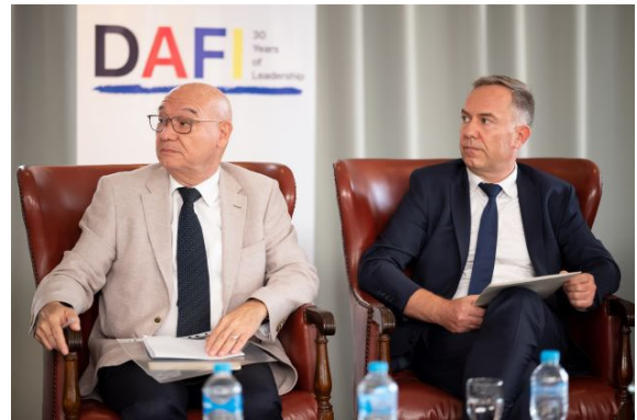
UNHCR's implementing partner, Catholic Relief Services, celebrated the 30 th anniversary of the DAFI scholarship in the attendance of the Ambassador of Germany and UNHCR Egypt Representative on 26 September 2022.