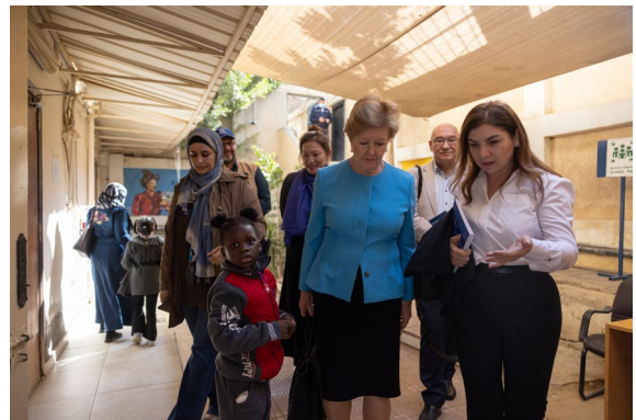
Assistant High Commissioner for Protection during her visit to the main building in 6 October City ©UNHCR/Pedro Costa Gomes.