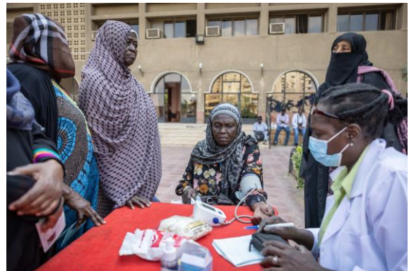
UNHCR's implementing partner, Caritas, marked the International Elders Day on 28 October with an eventful day full of recreational activities and health screening for diabetes and hypertension.