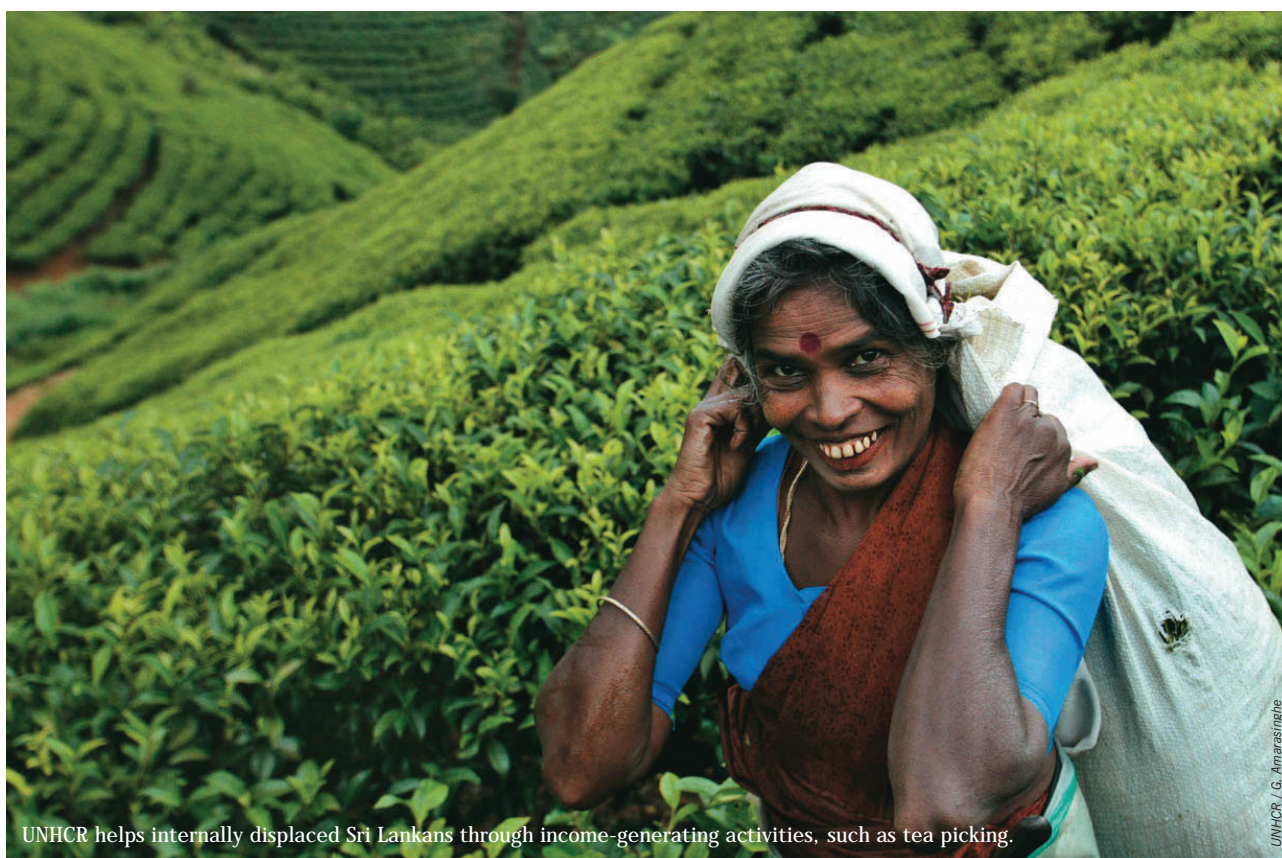
UNHCR helps internally displaced Sri Lankans through income-generating activities, such as tea picking.

In Australia, New Zealand, the People's Republic of China, Japan, Hong Kong SAR (China), Indonesia, the Republic of Korea, Thailand, the Philippines and Malaysia, private sector fundraising is already underway or being considered for the future. UNHCR continues to promote the inclusion of refugee matters in the agenda of UN Country Teams, particularly by lobbying with agencies working in early recovery and development to support the provision of services to refugee-hosting communities and reintegration programmes. UNHCR also advocates for the inclusion of refugee and asylum issues within broader regional agendas, such as that of