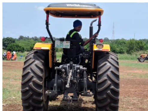
Refugee trainee in the driving seat

01 Country Office in Accra 01 Field Office in Takoradi