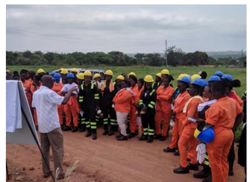
Women trainees with an instructor