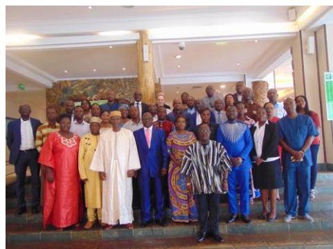
Participants at the Regional Meeting in Accra

01 Country Office in Accra 01 Field Office in Takoradi