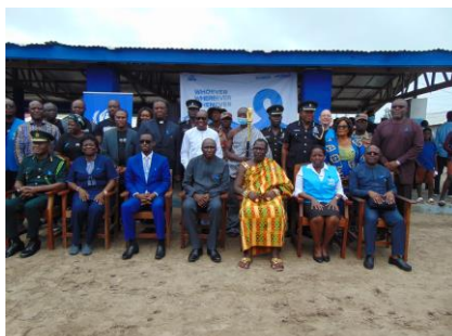
Interior Minister, UNHCR Representative, Chief of Ampain and some dignitaries who attended the World Refugee Day event at Ampain Camp.