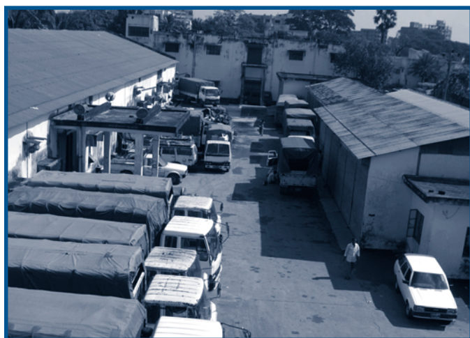
When selecting sites for HIV/AIDS commodity distribution, short- and long-term system requirements must be considered.

The LMIS for these commodities may need to be separate in the short-term for rapid scale up, but integrated with other health programs for long-term sustainability and to reduce duplication and reporting requirements on already over-burdened staff and/or data collectors. Regardless of the information system selected, programs need a logistics data collection system that is user friendly and that can provide timely and accurate data. Program managers at all levels must analyze the data collected and give feedback to health care providers and staff