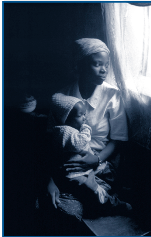
Mothers and their families ultimately benefit from efficient and effective supply chains.

Compounding the issue of service capacity is the inability of the program to manage significantly increased quantities of HIV test kits to test 5 million new individuals every year. A recent national stock status survey of key health commodities found that few facilities below the hospital level carried HIV test kits, and, of those that did, often there was only one type of HIV test kit in stock. At least two different types of HIV test kits are required to accurately inform a client of their HIV-positive status.