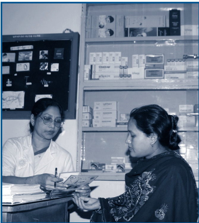
A coordinated procurement process leads to timely commodity distribution and a satisfied customer.

It may be necessary, for overall system efficiency, to set up a parallel distribution system in the short-term, separate from other health commodities, but set up in such a way that