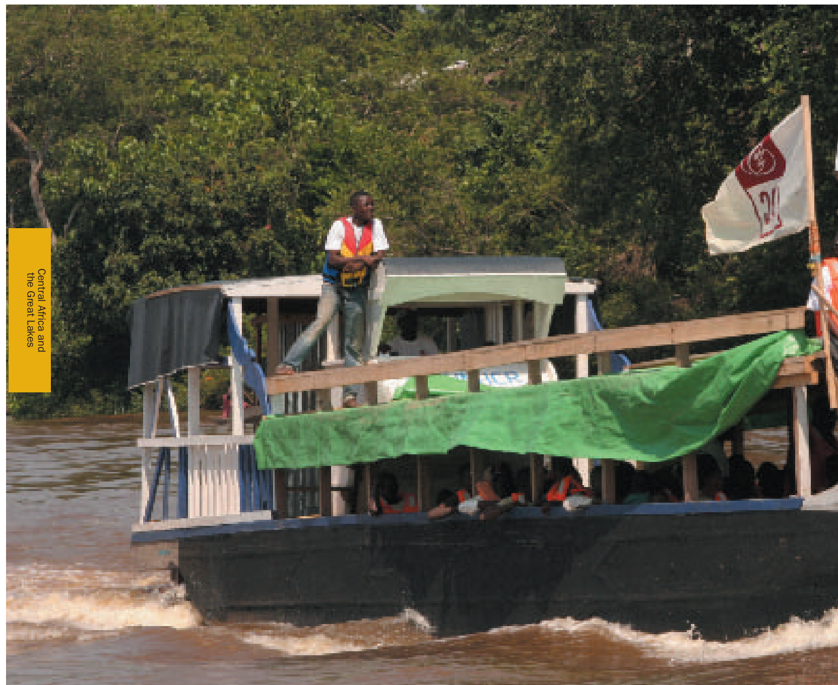
Republic of the Congo: Refugees returning home to the Democratic Republic of the Congo (DRC) aboard a transfer boat on the Oubangui River. They will stop at a transfer centre in Monzombo, DRC, and from there, many will be taken by truck to their home villages. Others will have to walk.

With regard to repatriation to the DRC, a tripartite agreement signed with Tanzania in late January 2005 was a welcome addition to the two agreements already signed in 2004 with CAR and RoC. Similar agreements are also being prepared, notably with Sudan. The official launch of facilitated repatriation from Tanzania to safe areas of return in southern Kivu is scheduled for mid-October 2005. It is worth noting that since October 2004, more than 20,000 refugees have already returned home to the DRC.