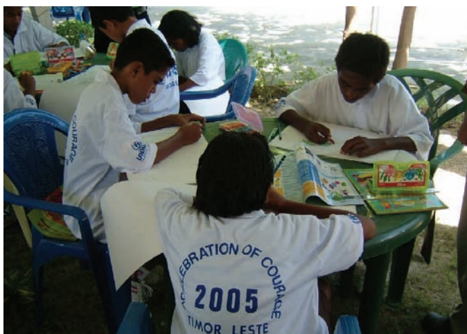
Drawing activity:

A TV interactive show was broadcast in the evening of 15 June 2005. Viewer's questions on refugees, asylum seekers and common immigration issues in Timor-Leste were answered by three speakers from the Immigration Department, the Parliament and UNHCR. In addition, WRD spots were aired daily on both TV and radio along with interviews of UNHCR staff and the Tetun version of the Global View 2005.