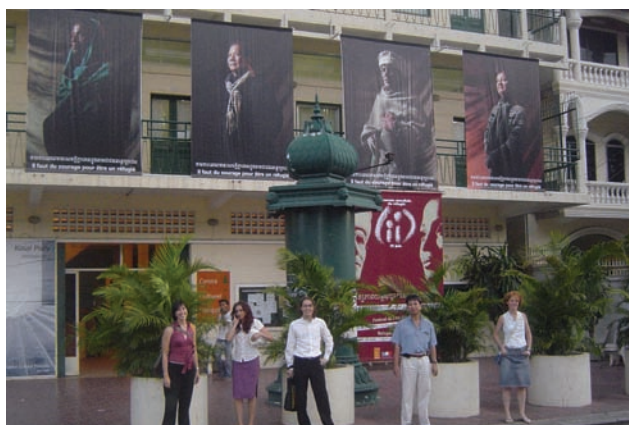
Courage banners decorated the entrance of the CCF where the film festival took place: ©UNHCR/M. Coghlan

The first ever Refugee Film Festival in Cambodia took place in Phnom Penh from 20 to 26 June. It was so successful that a follow-up was organized in another Cambodian city, Siem Reap, from 5 to 14 July, and some NGOs have asked UNHCR to borrow some of the films for further screening. The festival was made possible due to a very productive partnership between the French Cultural Centre (CCF) and UNHCR. The media campaign was very successful in raising awareness of the festival. 10,000 leaflets and flyers were distributed, announcements were put on websites and CFF's official magazine and an e-mail campaign was sent to embassies, media members and UN agencies.