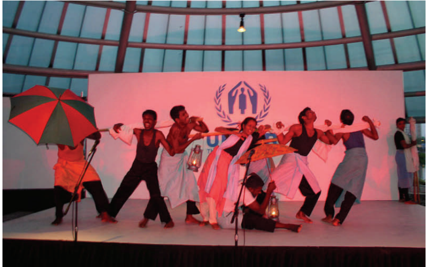
Sri Lanka: Drama festival