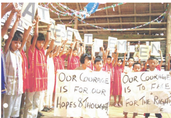
Tham Hin Camp: Children talking about courage and durable solutions

Events in Bangkok included a month-long exhibition of posters produced for World Refugee Day at the United Nations Building and a radio interview on Radio Thailand's English News Service by UNHCR. The media coverage was estimated to have reached 25% of the population in Thailand. There was also a refugee food festival and art exhibit at the Bangkok Refugee Centre.