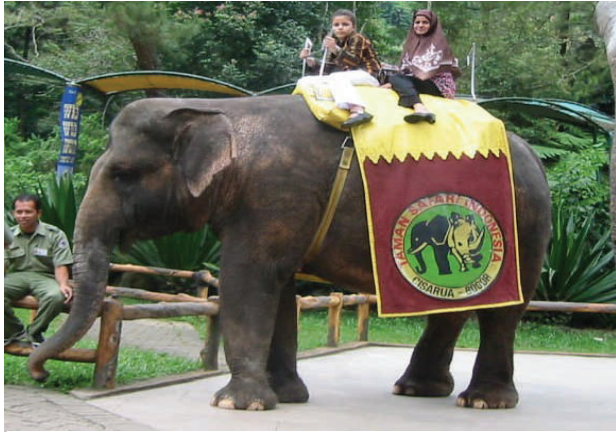
Refugees having a fun ride on the elephant

nation and collaboration of UNHCR and its implementing partners, Yayasan Pulih and PMI, with the local authorities. The session was attended by 33 participants.