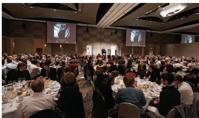
Over 400 people joined Australia for UNHCR for their annual World Refugee Day breakfast in Sydney: ©UNHCR/Australia

The Regional Office in Australia also covers New Zealand and Papua New Guinea.