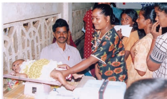
Refugees, at the Puzha refugee camp for Sri Lankan refugees in Tamil Nadu, Lining up for the medical camp

WRD was celebrated with the refugee community in two areas of Delhi with large refugee concentration. In addition to the cultural programme , free eye-checks to 170 refugees were carried out by UNHCR's health implementing partner at both venues. In Vikaspuri, West Delhi, 300 refugee children of all nationalities participated in a cultural program of song and dance. Nizamuddin, South Delhi, held a smaller day-long celebration with about 150 refugees from Afghan, Iranian and African origin where the programme included a cultural show , story telling and a quiz . This activity was covered in the media.