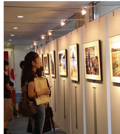
Photos of the refugee exhibition venue "Angolan Refugees and Local Zambians"

The international conference hall of the UN House hosted a WRD public symposium "Perspective of Japan's Acceptance and Assistance for Refugees" on 18 June. It was organized in cooperation with UN University, PARinAC Japan Forum and Japan for UNHCR and supported by Cabinet Secretariat, Ministry of Foreign Affairs (MOFA), Agency for Cultural Affairs, Ministry of Justice, Ministry of Health, Labour and Welfare, and the Yomiuri Shimbun newspaper. The symposium was attended by approximately 340 people and Mrs. Sadako Ogata's special video message was screened.