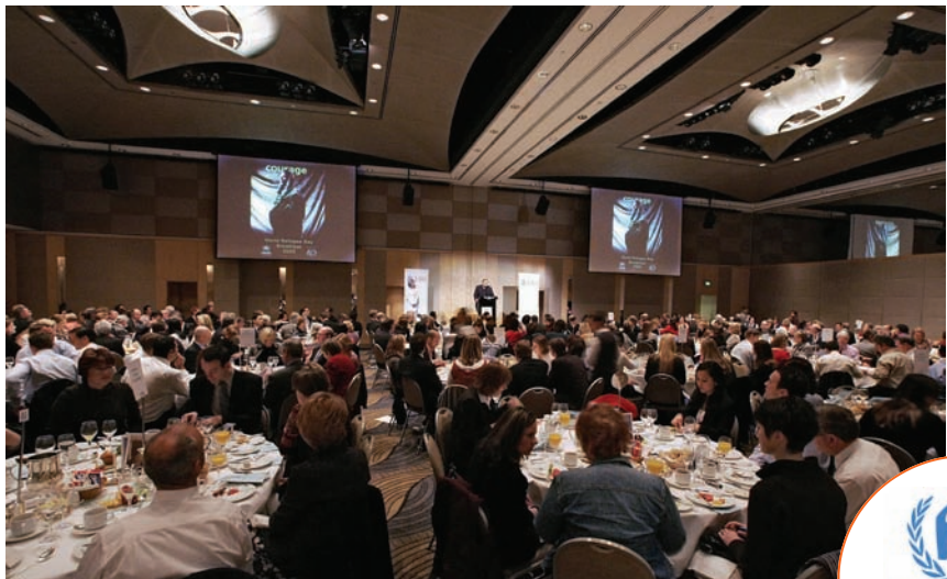
Australia: Over 400 people joined Australia for UNHCR for their annual World Refugee Day breakfast in Sydney