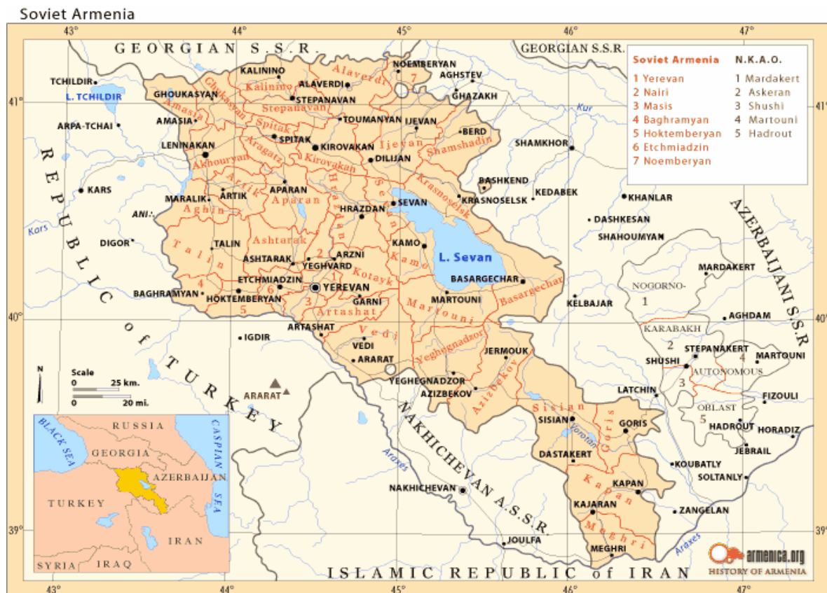
Figure 1. Armenia and the Nagorno-Karabakh region in Azerbaijan in 1991, as republics of the USSR and shortly before the declaration of independence of both nations

Soon the violence grew out into a military confrontation between the two neighbouring Soviet Republics which increased even in severity after Nagorny Karabakh declared independence on 2 September 1991 from the USSR, followed three weeks later by Armenia and on 18 October by