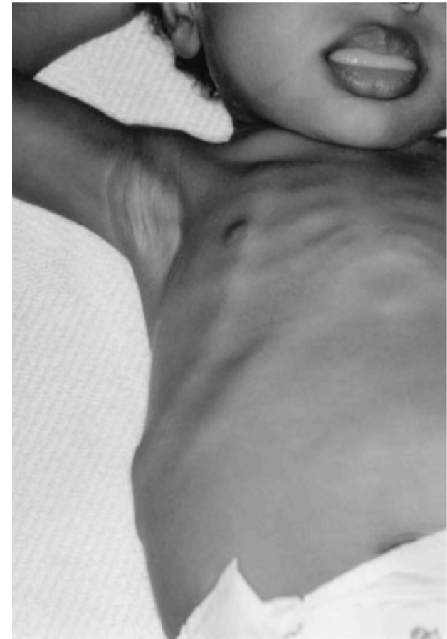
Beading of the rib cage (rachitic rosary)