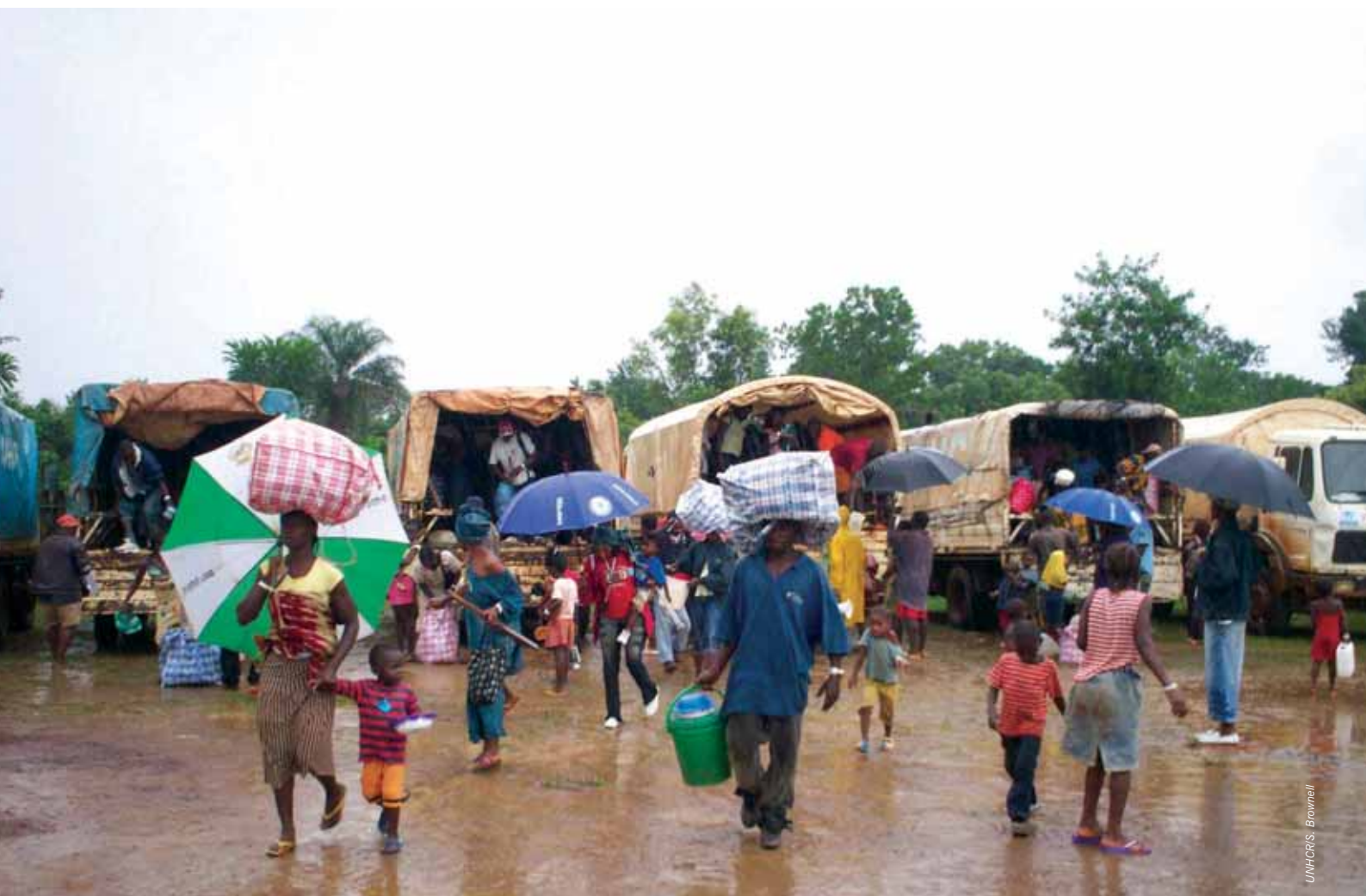
Liberia. Weary but happy Liberians clamber off lorries that brought them back home from Sierra Leone at the end of UNHCR's Liberian repatriation programme.

At the regional level, one of UNHCR's main objectives is to strengthen its partnership with ECOWAS. In addition to monitoring the political and security situation in countries in post-conflict recovery, UNHCR is collaborating with ECOWAS to promote the local integration of residual groups of refugees in countries of asylum. To this end, it will seek better implementation of the residence provisions of the ECOWAS protocols relating to the free movement of people.