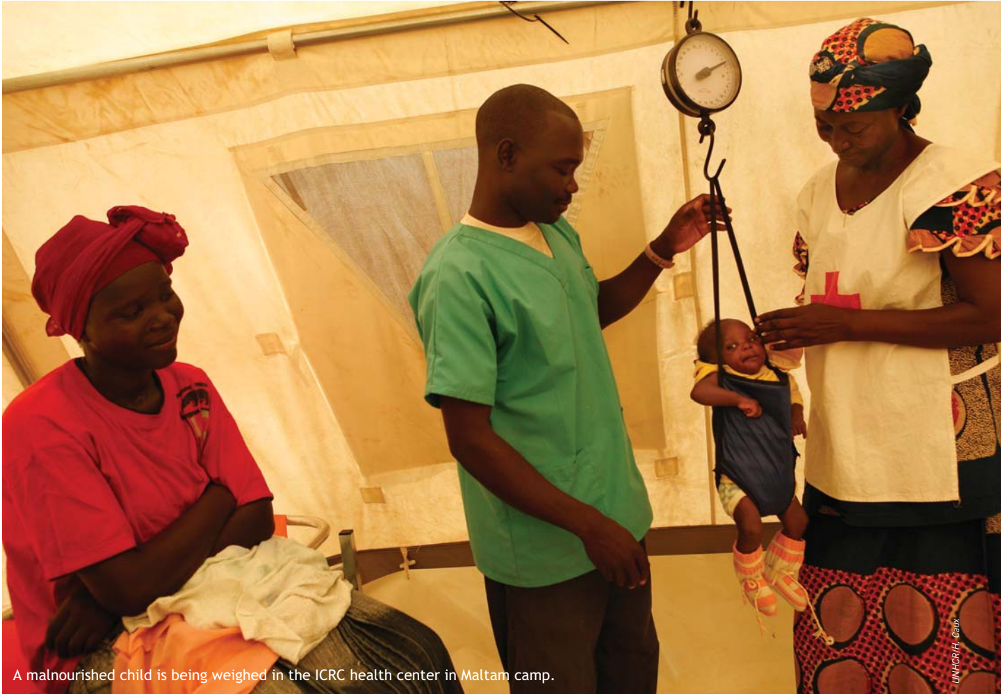
A malnourished child is being weighed in the ICRC health center in Maltam camp.

The Office estimates that up to 5,000 refugees from Chad will have to be relocated from the Langui camp to the site in Poli. UNHCR's protection strategy will bid to improve the reporting of, and response to sexual and gender-based violence in camps. Refugee students will be assisted in gaining access to education.