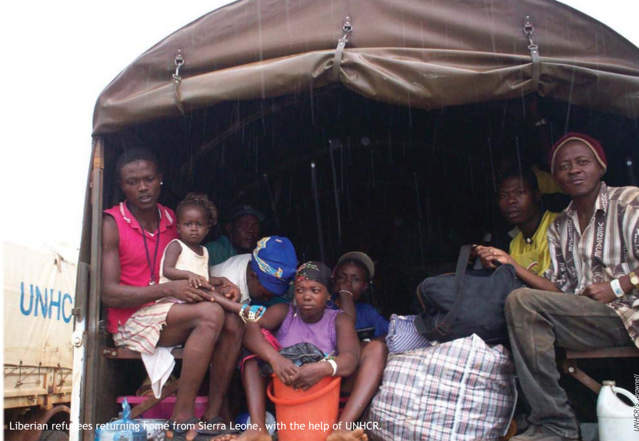
Liberian refugees returning home from Sierra Leone, with the help of UNHCR.