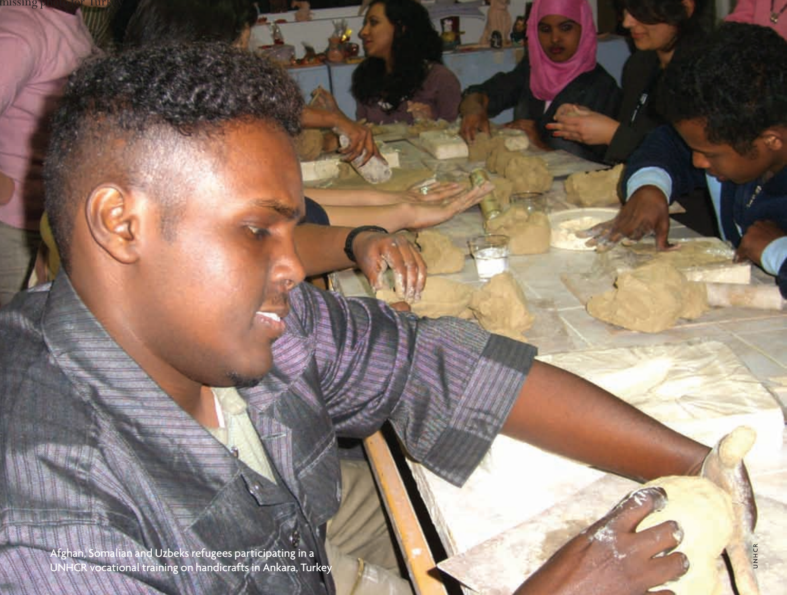
Afghan, Somali and Uzbek refugees participating in a UNHCR vocational training on handicrafts in Ankara, Turkey