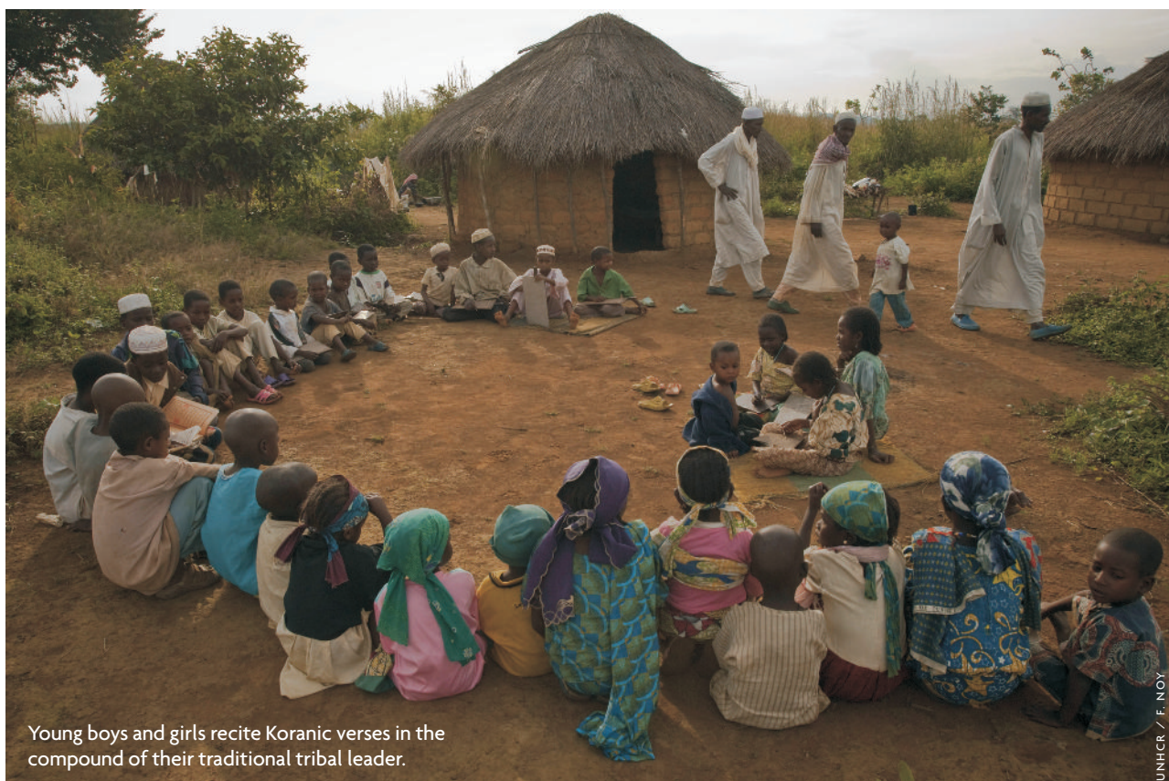
Young boys and girls recite Koranic verses in the compound of their traditional tribal leader.

In the Adamaoua region, a UNHCR programme to address sexual and gender-based violence provided medical and psychological support to survivors. All women and girls of childbearing age were provided with sanitary materials and soap. In urban areas, vulnerable refugees benefited from monthly subsistence allowances. UNHCR helped to establish six women's associations in urban areas. Some 17 women received training in food-processing and decoration during celebrations to mark the Day of the African Woman.