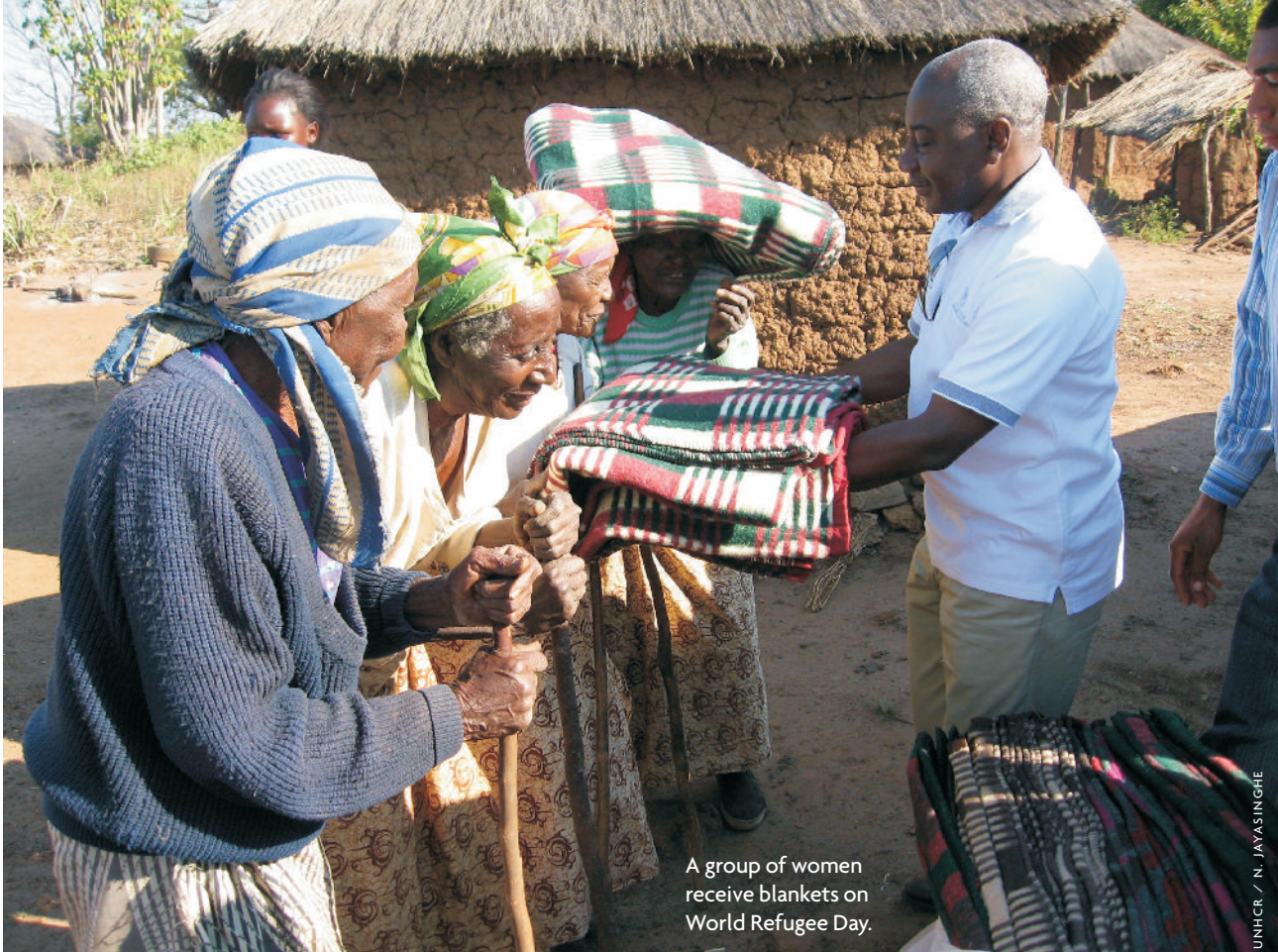
A group of women receive blankets on World Refugee Day.