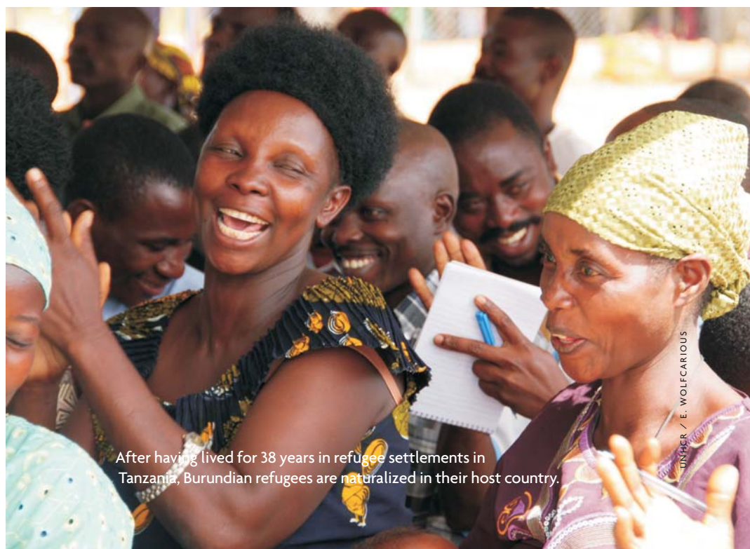
After having lived for 38 years in refugee settlements in Tanzania, Burundian refugees are naturalized in their host country.

Another group of Burundian refugees of the 1972 group, who settled in villages in the Kigoma region, will be offered opportunities for durable solutions, including naturalization. The registration of this group, comprising some 22,000 people, is underway, and individual preferences for repatriation to Burundi or naturalization and integration in Tanzania, are being recorded.