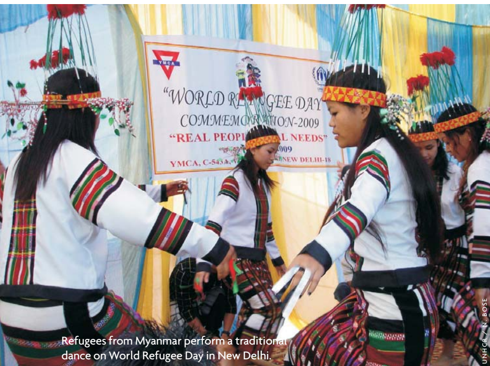
Refugees from Myanmar perform a traditional dance on World Refugee Day in New Delhi.

They do not have the legal right to work, but are able to find low-paid employment in the informal job market.