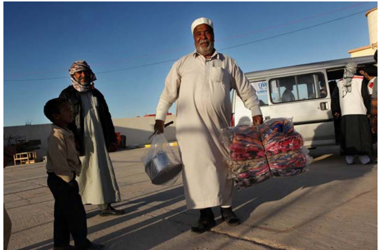
A displaced man from Ajdabiya carries blankets and a kitchen set he has just received from UNHCR in Tobruk. UNHCR non-food items are distributed through a local partner.

An Inter-Cluster assessment mission composed of UNHCR (Shelter/NFI and Protection), WHO (Health), UNMAS (Mine Action), UNICEF (WASH and Education), WFP (Food Security), UNDSS (Safety and Security) and OCHA (Coordination) visited Ajdabiya from 7-10 June. The mission also met with representatives of the local Relief Committee and members of the Libyan Red Crescent (LRC). The LRC is currently the main humanitarian actor in the city, carrying out food distribution and monitoring the return of internally displaced Libyans. According to reports, 70% of the local population was displaced during the conflict. According to the LRC, a majority of those displaced in March and April have returned to Ajdabiya since the opposition forces gained control of the town. UNHCR cannot verify these reports.