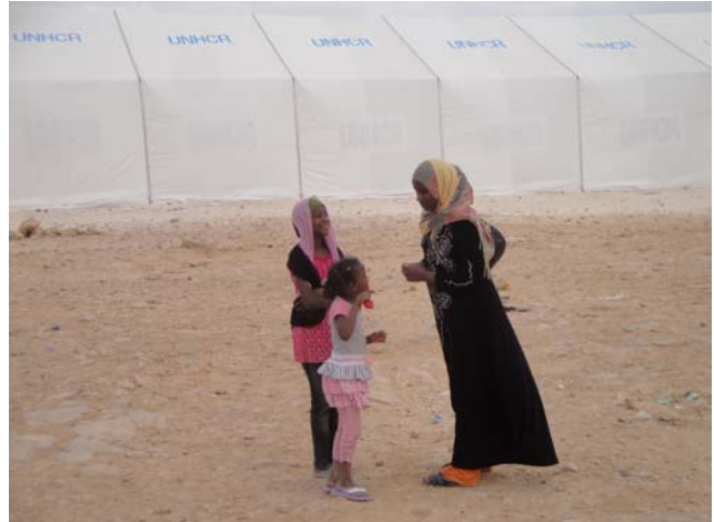
Children playing inside and outside the rub halls at Saloum border.