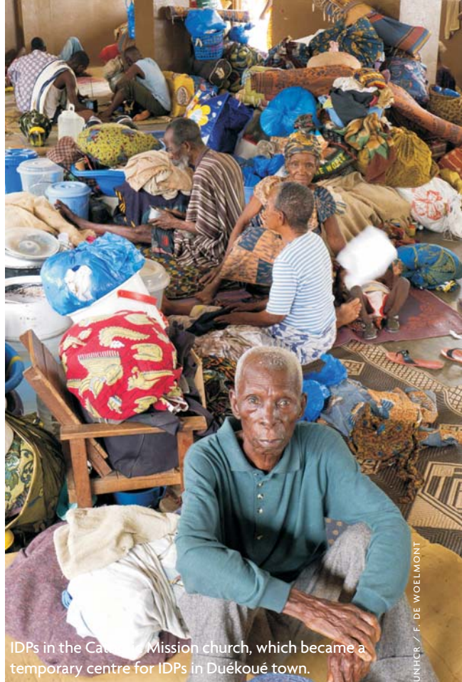
IDPs in the Catholic Mission church, which became a temporary centre for IDPs in Duékoué town.

In 2012, UNHCR will work with the Government in conducting activities to