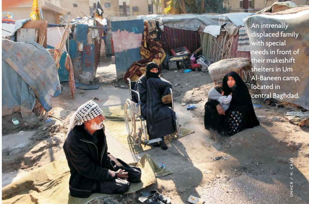
An internally displaced family with special needs in front of their makeshift shelters in Um Al-Baneen camp, located in central Baghdad.