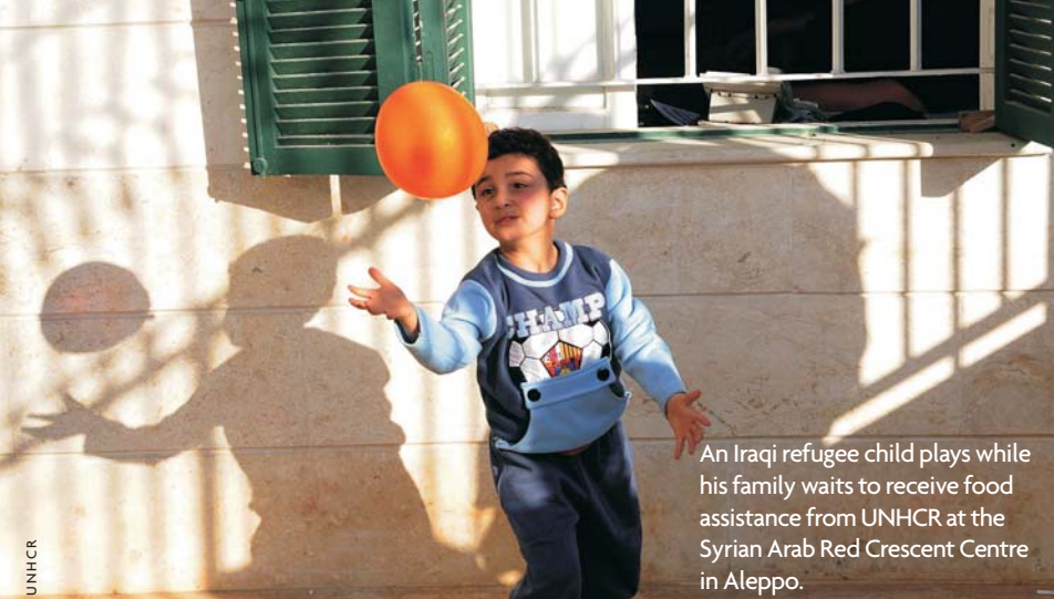
An Iraqi refugee child plays while his family waits to receive food assistance from UNHCR at the Syrian Arab Red Crescent Centre in Aleppo.

been drafted allowing Syrian mothers to pass on their nationality to their children. UNHCR has formally informed the Syrian authorities of its readiness to provide any support these initiatives and their implementation may require.