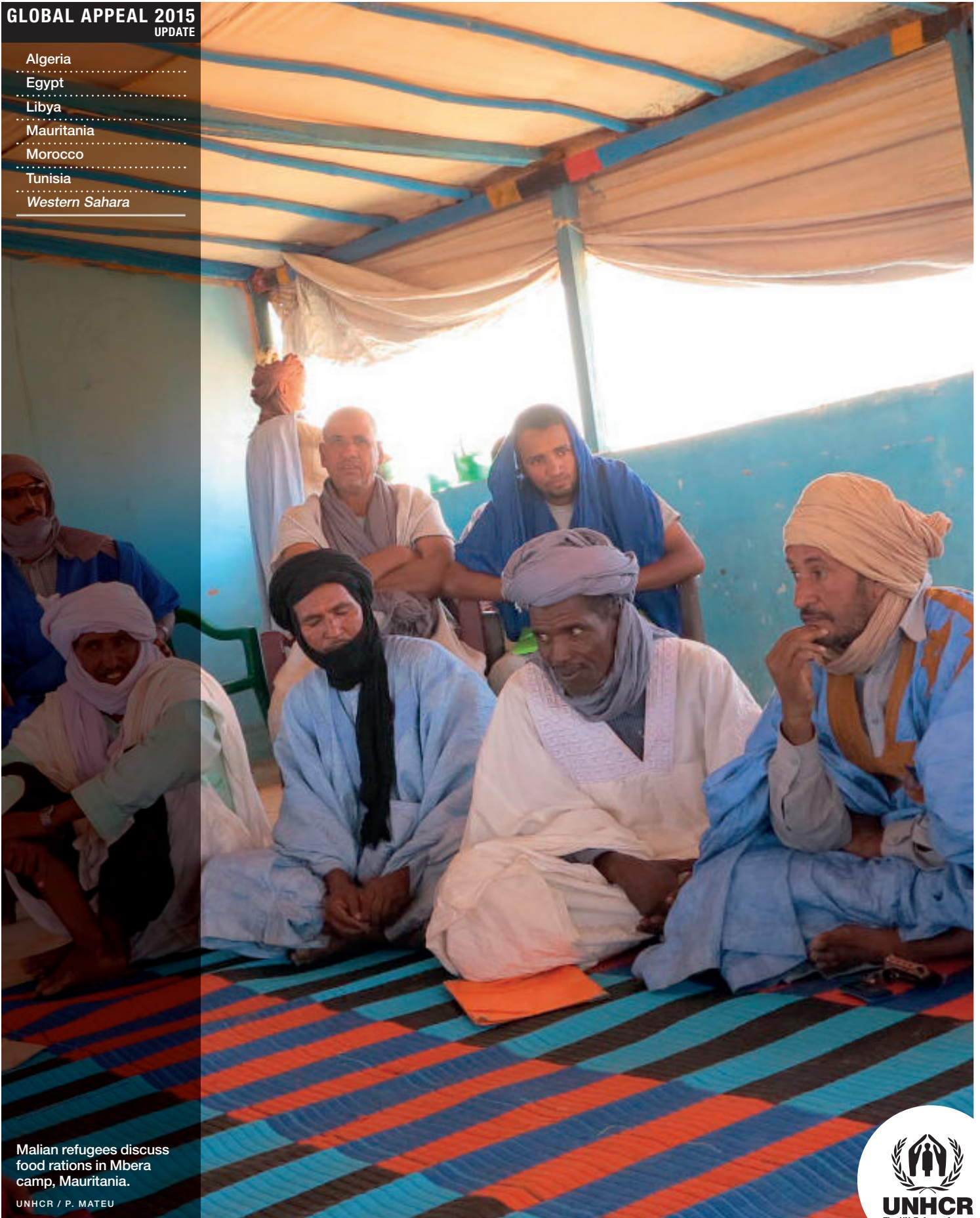
Malian refugees discuss food rations in Mbera camp, Mauritania.