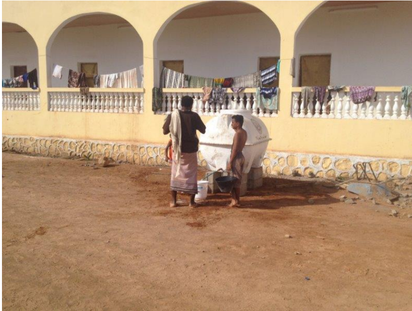
A water point in the temporary transit center Al-Rahma, an under-construction orphanage in Obock where Yemeni refugees are hosted before their transfer to the Markazi refugee camp.