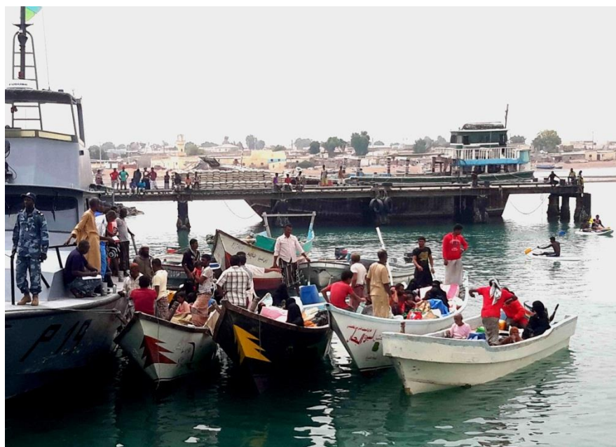
Boats with Yemeni refugees arriving at the port of Obock, in the North of Djibouti. Some of the new arrivals came from Bab al Mandeb, a village of fishermen in Yemen. They could flee from fighting in Yemen using their own boats.

As of 24 May 2015, over 12,900 people of more than 68 nationalities arrived from Yemen to Djibouti, by sea and by plane since the outbreak of the crisis. The number includes 5,846 third country nationals (TCNs), 5,455 Yemenis and 1,688 Djiboutian returnees. Fleeing Yemen to save their lives following experiences of extreme hardship, a great proportion of them reached Djibouti emotionally overwhelmed, sick, injured, and bringing with them minimal material possessions.