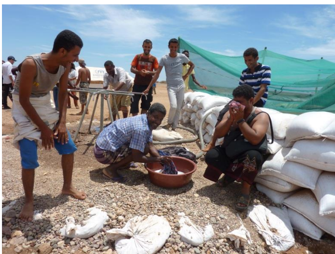
Yemeni refugees at the water point on the Markazi camp site. Two water bladders are currently installed in the camp with a capacity of 15,000 litres each.

The WASH sector working group will ensure the coordinated response to avoid gaps and overlaps in assistance provided by UNICEF, UNHCR, FAO, IOM, and NRC, as well as by respective partners and national institutions.