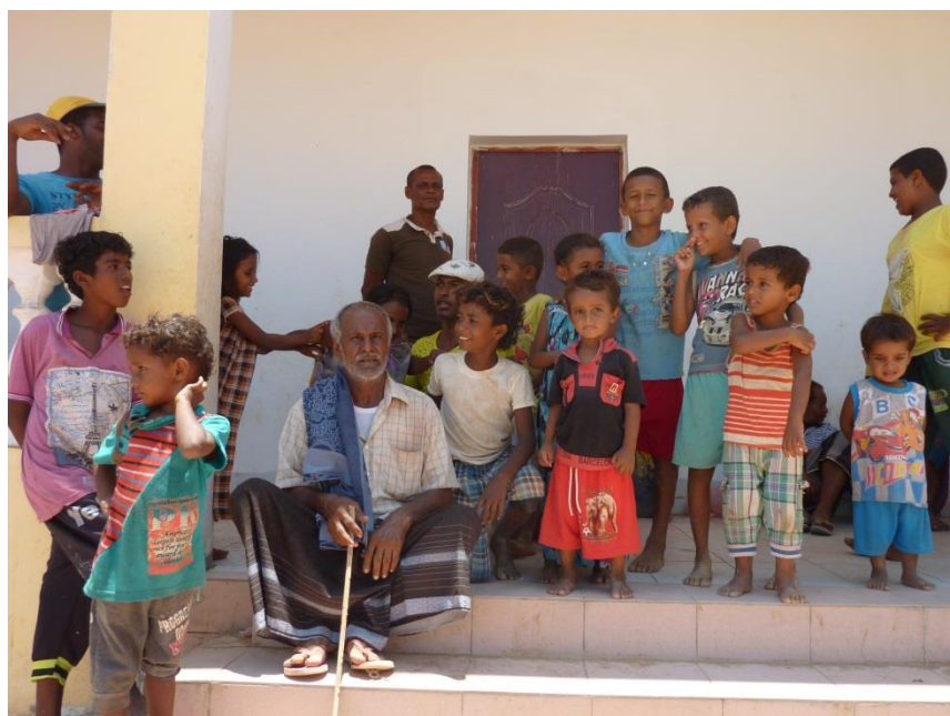
Yemeni refugees in the Al-Rahma transit centre in Obock.

Many children fleeing the conflict in Yemen carry chronic diseases; others have been exposed to life-threatening situations and the increased stress made them particularly vulnerable to diseases. Diarrheal diseases and acute respiratory infections could lead to death if children do not benefit from adequate medical care. There are cases of pregnant women in need of urgent assistance upon arrival due to complications and others who continue at risk. Complications during pregnancy can cause the death of the mother or of the newborn. Furthermore, existing health services are not adequately prepared for these types of situations and are unable to ensure proper care management of children (particularly newborn babies) and women. Reproductive health services need to be further supported, in particular with regard to response and prevention of HIV/AIDS.