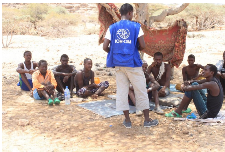
Sensitisation session for Ethiopian migrants on regular migration and the correct use of water in Fante Herou, Obock.

While some Djiboutian returnees can count on the support of their families, those who had remained in Yemen for a prolonged period might have lost their ties with Djibouti and have arrived with no means to sustain themselves and their households. These vulnerable individuals, some 2,100 people according to IOM estimates, will need immediate livelihoods support in terms of food-vouchers and micro-business start-up.