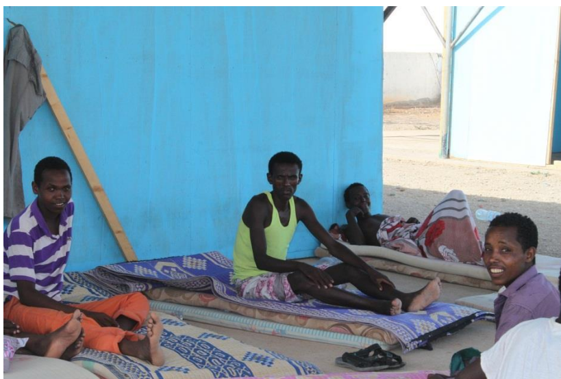
Ethiopian migrants at the IOM Migration Response Centre in Obock are waiting for their assessment for the Assisted Voluntary Return Programm (AVR) to Ethiopia.

The response is designed to ensure extension of basic humanitarian assistance to vulnerable stranded migrants by continuing to operate the Migration Response Centre in Obock and expanding/enhancing its premises and service capacities in order to meet the requirements of the increased migration flow.