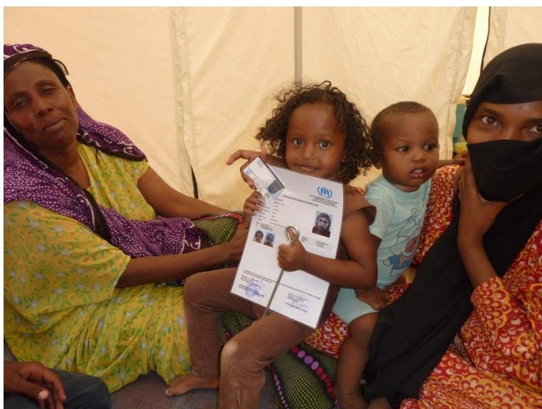
A refugee family from Yemen has found refuge in the Markazi camp in Obock. In the camp they have been provided with shelter, food, medical assistance and their refugee documents (ID-cards and family attestation).

As the majority of the refugees enter Djibouti by boat it will be crucial to ensure unhindered access to territory and protection space, and work closely with the authorities to provide the capacities for rescue at sea. Individual registration of refugees and profiling is another key priority in order to capture the needs, vulnerabilities as well as the profiles of newly-arrived refugees. This will enable organizations involved in the response to provide targeted assistance according to the respective needs.