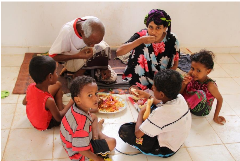
A family of Yemeni refugees has lunch together at the temporary transit center Al-Rahma, Obock, where new arrivals are provided with hot meals.

The nutrition sector working group will ensure the coordinated response to avoid gaps and overlaps in assistance provided by UNICEF, UNHCR, ONARS, WFP, WHO, FAO and AHA, as well as by respective partners and national institutions.