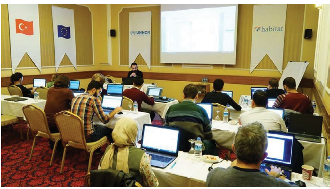
Participants of the Livelihoods IMECE Programme in Turkey (See case studies in the Annex).

Some developed countries are introducing policy measures to attract migrant entrepreneurs who can bring new knowledge and create jobs. Most desirable are highly skilled newcomers behind high-tech and high-growth start-ups. An increasingly popular way to do this is through start-up and entrepreneur visas. In contrast to the policy efforts mentioned in box 2.1a, which are designed to facilitate refugee and migrant entrepreneurship regardless of skill level or education, start-up and entrepreneur visas are typically used as a measure for attracting highly skilled migrants operating in a narrow range of business areas. These visas are therefore limited in scope and tend only to facilitate the entrepreneurship of very small numbers of migrants. Box 2.1b highlights the potential role of such visas in attracting highly skilled migrants.