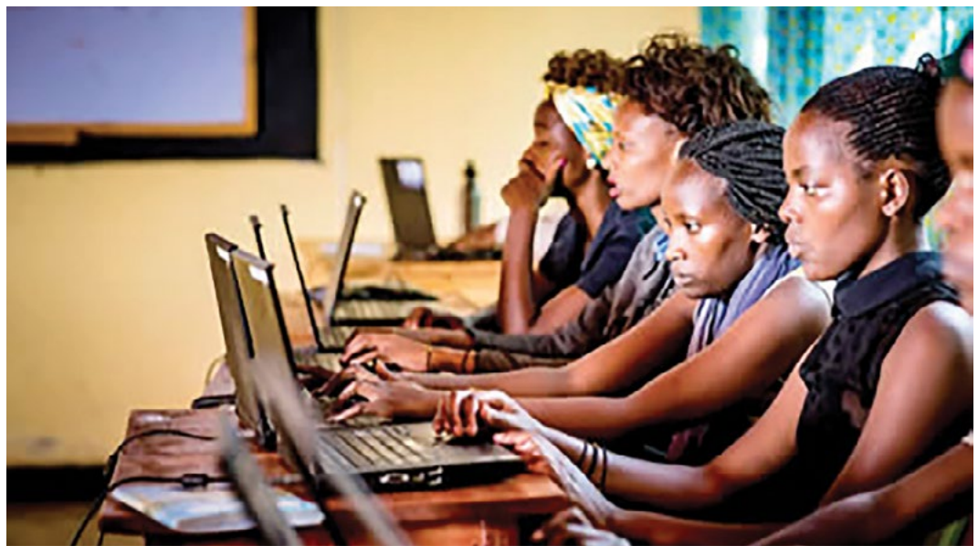
Rwandan female refugees attending a higher education pilot programme at Southern New Hampshire University, UK.

Measuring the impact of such initiatives should be based on a clear theory of change that articulates the intended impact. The theory of change should capture the intended impact of entrepreneurship initiatives on indicators such as increased income, job creation, economic growth, poverty alleviation, reduction in public expenditure and social inclusion. Theories of change can also be used to form the basis of cost-benefit analysis and randomized controlled trials, which are arguably the gold standard in impact measurement approaches. Analysing migrant and refugee entrepreneurship through a cost-benefit lens can support more nuanced debate on the resources that migrants and refugees can bring to the countries and communities in which they reside compared with the costs commonly associated with their stay (e.g. social protection benefits).