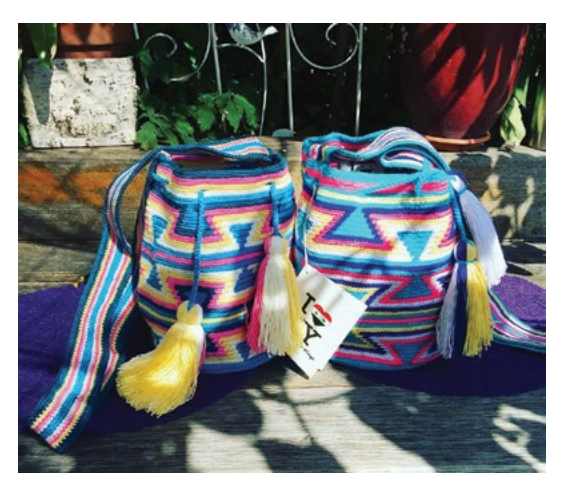
I Love Syria crochet bags made by women refugees participating in the I Love Syria initiative.