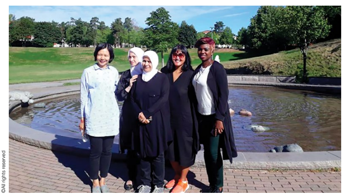
Women migrantes in the Ester programme in Sweden (See case studies in the Annex).