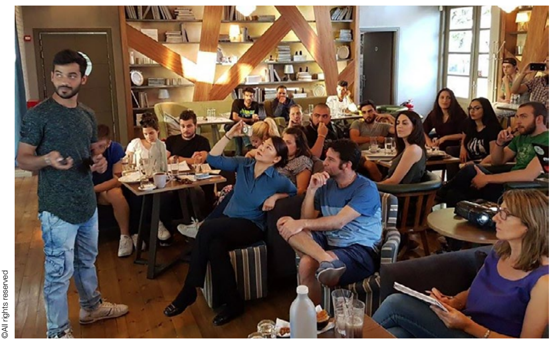
Participants of Changemakers Lab in Lesvos Island, Greece.

In addition to improving access to innovation and entrepreneurship support systems, policymakers can support initiatives that facilitate direct collaboration and co-working among refugee, migrant and local innovators and entrepreneurs. Such collaboration can catalyse innovation and growth, support social cohesion and solidarity, and help overcome political and public resistance to the arrival of migrants and refugees in host communities. A number of case studies reviewed for this guide indicated a common focus on bringing refugee and migrant entrepreneurs together with locals; involving students and local youth in incubator activities was highlighted as an especially effective way of facilitating collaboration and inclusion, as was the use of incentives such as business support and seed-funding prizes for mixed teams of newcomer and local entrepreneurs. One approach to engaging migrant and refugee entrepreneurs within the local entrepreneurship ecosystem is outlined in box 4.1b, on the InnoCampus Start-up Accelerator Programme in Turkey. Box 4.1c highlights other programmes that engage migrants and refugees in entrepreneurship and innovation ecosystems.