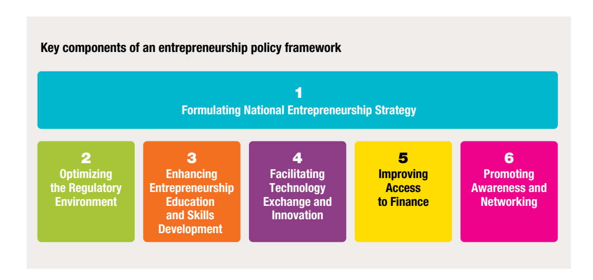
Figure 5. The UNCTAD Entrepreneurship Policy Framework