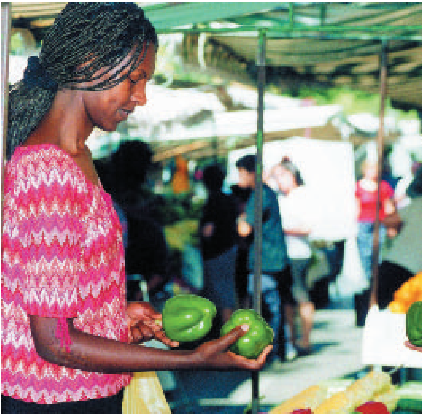
Chile: A Rwandan refugee woman at a market in Santiago.

In Argentina, the new Government placed human rights at the top of its agenda. The adoption of a new migration law, which replaced the more restrictive law of 1981, relaxed the criteria for residency for refugees. Unfortunately, however, unemployment rates were high despite an economic growth of seven per cent in 2003. The Government also reformed the upper strata of the army and police, which led to more streamlined, efficient forces. Through regional meetings, efforts were made to better coordinate their relations with other MERCOSUR countries.