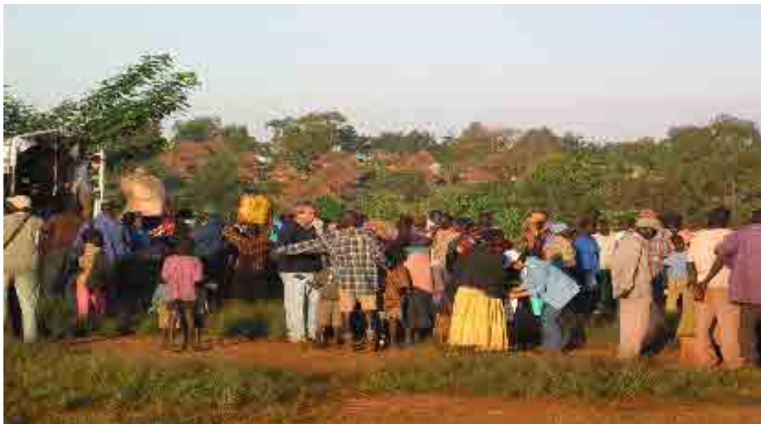
Sudanese refugees in Uganda

Accurate knowledge of IDP numbers and location has been hampered by lack of field presence. Of the estimated 3 to 4 million displaced, 1.8 million are presumed to live in Khartoum, 500,000 in eastern Sudan and transitional zone, 300,000 in southern states and 1.4 million in SPLM/A held areas. According to the scenario used in the 2003 CAP for Sudan, 1.5 million IDPs may return to their places of origin following a successful peace agreement. The appeal makes provision for assistance to some 80,000 displaced persons , whose areas of return are the same as the refugees.