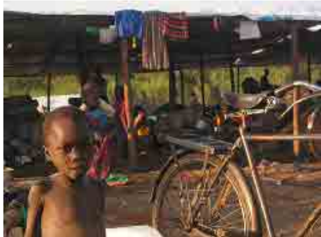
Sudanese refugee boy at the reception centre Kyangwali, Uganda

In terms of preparedness for the voluntary repatriation from neighbouring countries, UNHCR offices in the countries hosting refugees, have prepared individual repatriation plans for their caseload of Sudanese refugees. These plans have been consolidated into a Regional Operations Plan. The UNHCR office in Sudan, in co-ordination with other UN agencies, has also prepared a plan for the return and reintegration of southern Sudanese refugees which is included in the overall Regional Operations Plan.