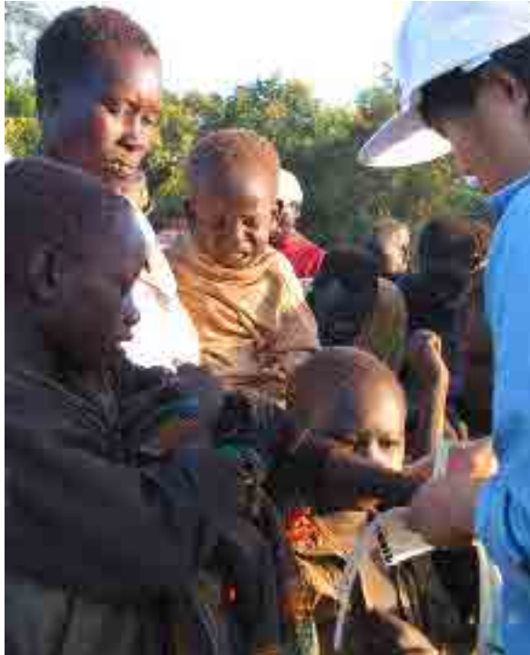
Wristbanding of Sudanese refugees in Kayngwali camp, Uganda.

The protection and humanitarian assistance activities to be undertaken both in countries of asylum and in the Sudan, before the peace agreement is signed and in preparation for the repatriation and reintegration of Sudanese refugees are listed in details below. They correspond to Phase 1 of the Regional Operations Plan for Repatriation and Reintegration of Sudanese Refugees.