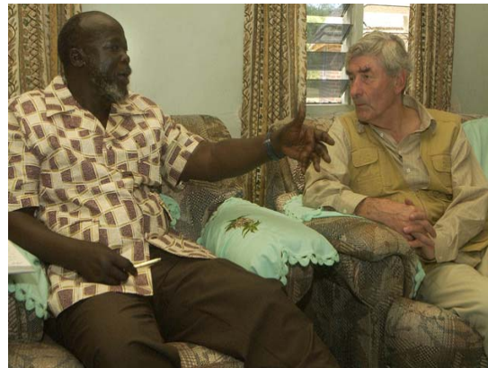
High Commissioner, Ruud Lubbers meeting with the Sudanese President and the SPLM leader during his mission to the East and Horn of Africa, 11-13 November 2003

The recent three-day visit by the High Commissioner to Sudan from 11 to 13 November 2003 was reported to be positive. The High Commissioner met with the President of Sudan and the leader of SPLM and outlined UNHCR's plans for repatriation. He stressed the need for a sustainable return and safety of aid workers. Both leaders gave assurances of co-operation and for the immediate implementation of reintegration projects in south Sudan.