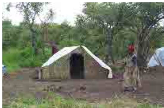
Shelter built by a refugee family upon their arrival to Uganda

Apart from a brief period from 1972 to 1983, Sudan has been at war with itself. The 20 years of conflict between the Government of Sudan and the SPLM/A has been the principle source of suffering for the Sudanese people. Sudan has the largest displaced population in the world with some 570,000 Sudanese refugees in neighbouring countries of Chad (70,000) following the fighting in Darfur in August 2003, DRC (69,000), Egypt (30,324), Eritrea (661), Ethiopia (88,000), Kenya (59,500), Uganda (223,000) and three to four million internally displaced persons. In addition to two million deaths directly attributed to the fighting, the lives and livelihoods of a significant number of people have been disrupted. This situation is further complicated by the ongoing inter-related layers of conflict which are not covered in the ongoing peace process.