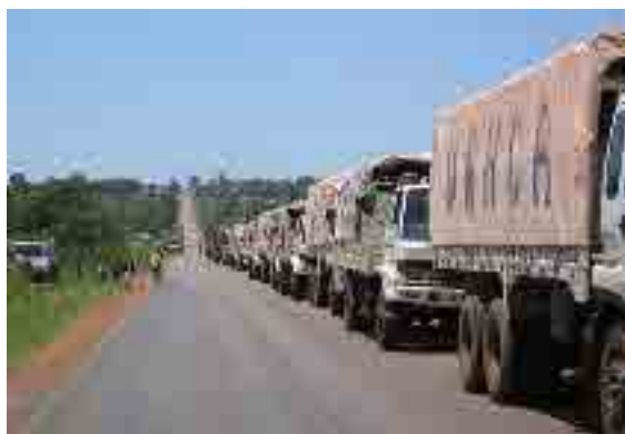
UNHCR convoy in Kiryandongo, Uganda