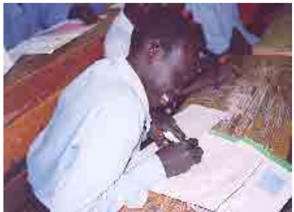
Sudanese refugee child in Sakakini school, Cairo/Egypt.