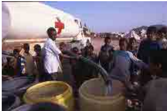
Water supply being provided by an implementing partner.