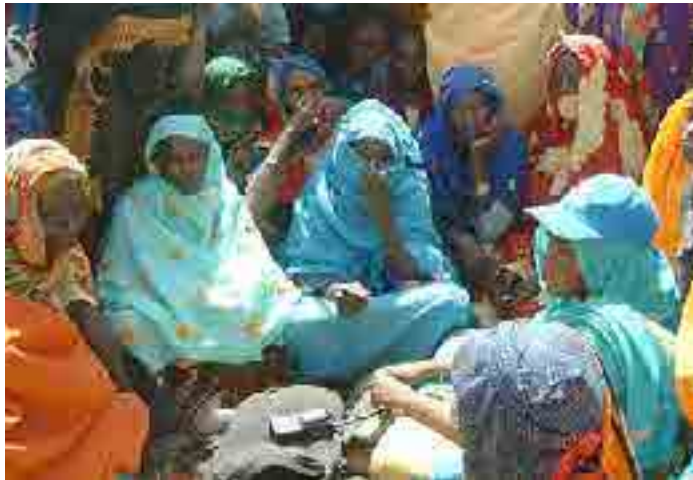
UNHCR's emergency team visiting Sudanese refugee women at the Chadian border town of Tine.

Incursions into eastern Greater Equatoria by the Uganda based Lord's Resistance Army (LRA) continues to terrorise local communities, destroy livelihoods and jeopardise humanitarian operations. The Equatoria Defence Force (EDF), which operates in the same theatre, is also a source of instability in the south. Sporadic and severe fighting linked with oil field developments erupts periodically in the western and eastern Upper Nile. In addition, militia and rogue elements in parts of the Upper Nile and elsewhere in the country perpetuate insecurity and instability. This is